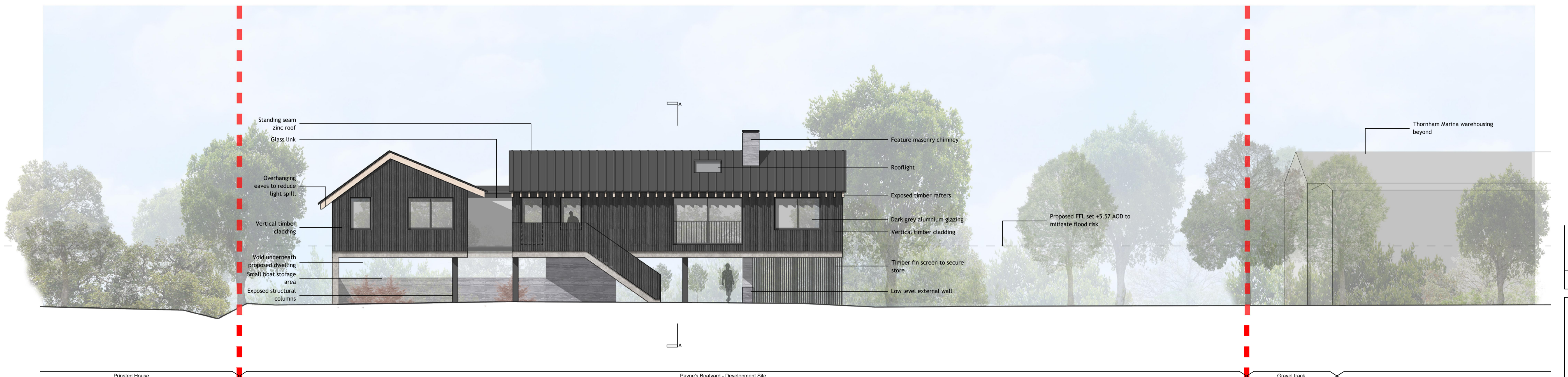
SOUTH-WEST ELEVATION 1:100