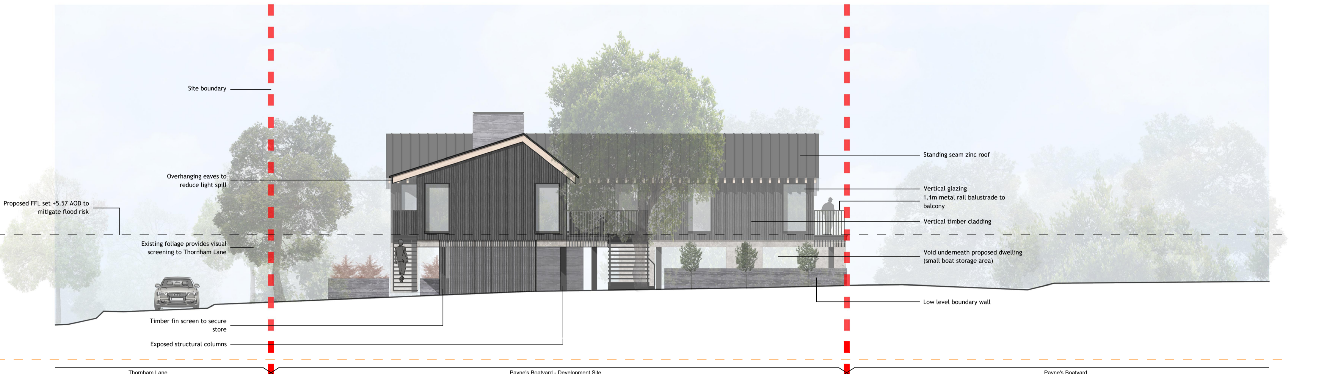
SOUTH-EAST ELEVATION 1:100