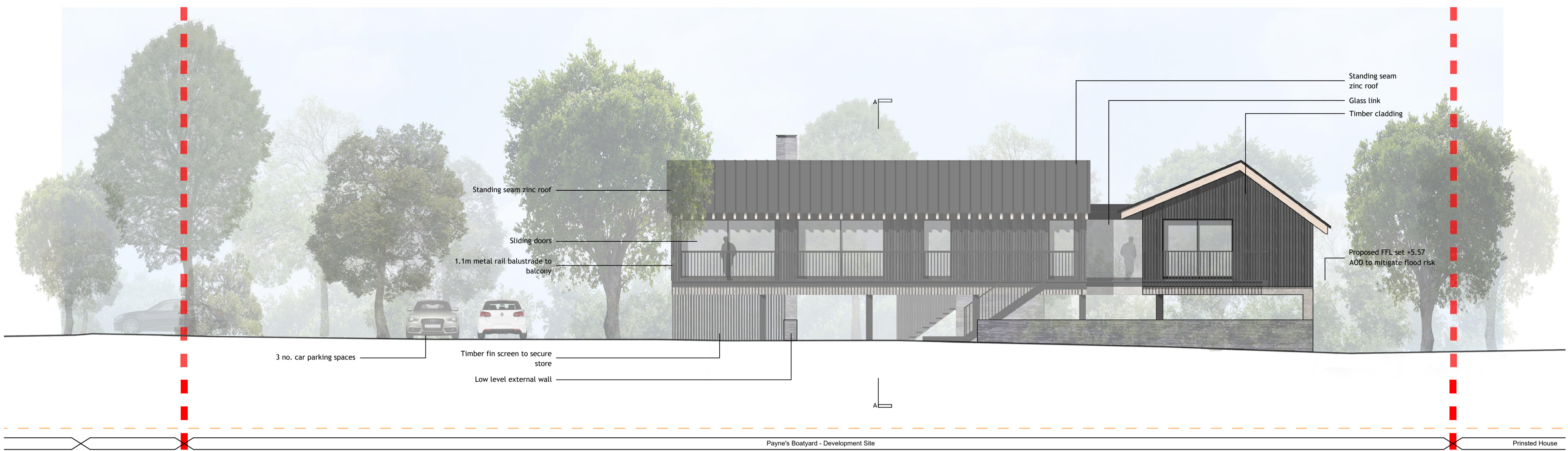
NORTH-EAST ELEVATION 1:100

GENERAL NOTES Dimensions to be checked on site before commencing work. Any discrepancies shall be reported to the architect immediately. Do not scale from these drawings except for planning purposes. Use figured dimensions only. ACCOMPANYING DOCUMENTATION All details shown on Helyer Davies Architects drawings are to be read in conjunction with the project specification and other consultants drawings and details.