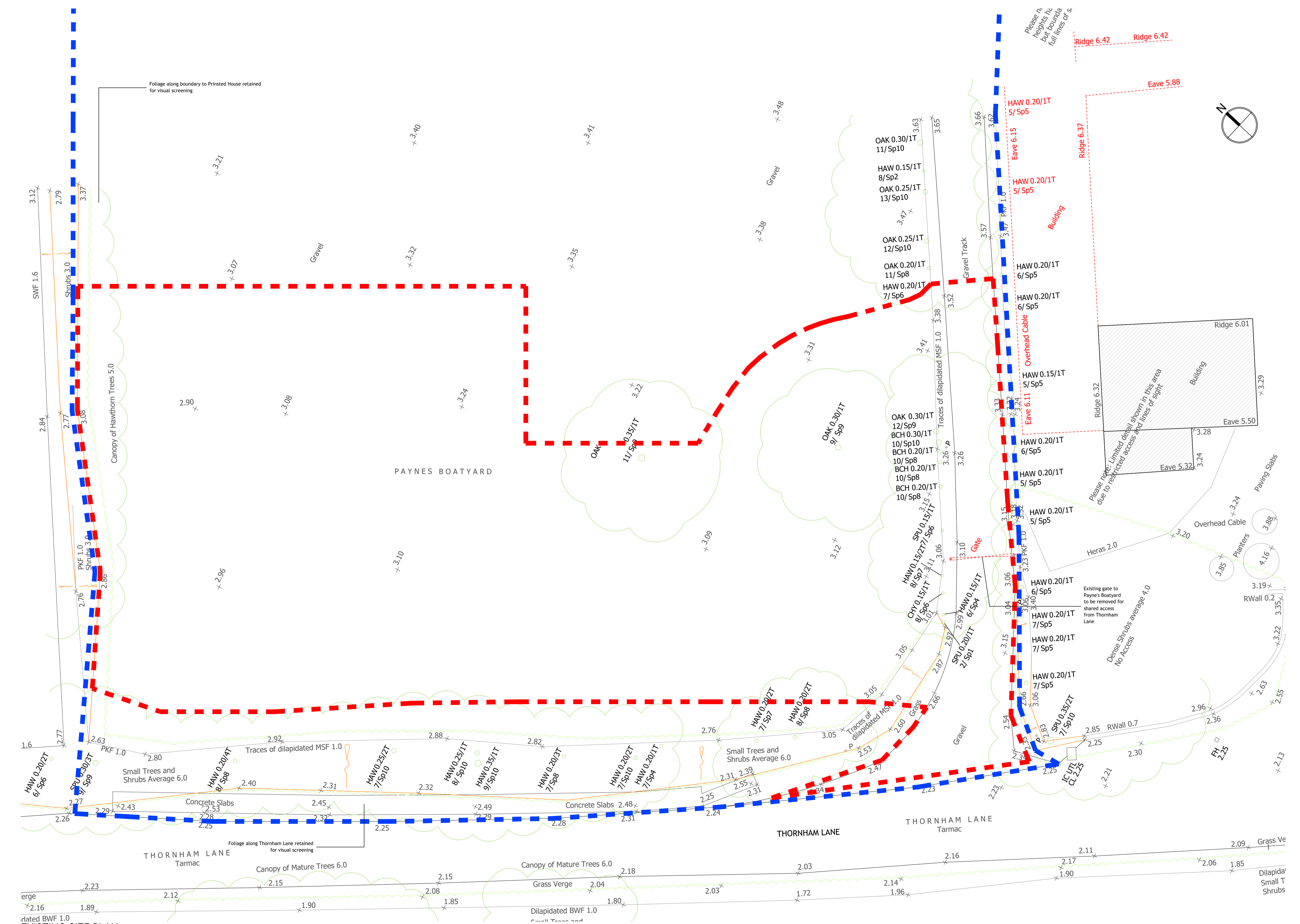
EXISTING SITE PLAN 1:100

GENERAL NOTES Dimensions to be checked on site before commencing work. Any discrepancies shall be reported to the architect immediately. Do not scale from these drawings except for planning purposes. Use figured dimensions only. ACCOMPANYING DOCUMENTATION All details shown on Helyer Davies Architects drawings are to be read in conjunction with the project specification and other consultants drawings and details.