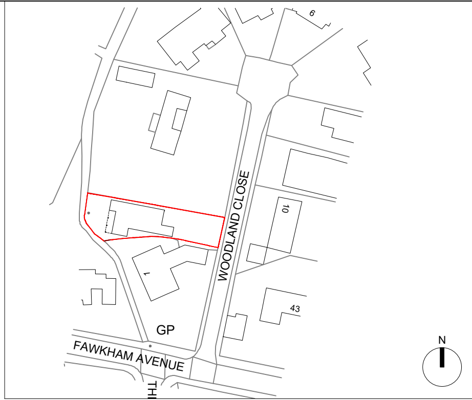
EXISTING LOCATION PLAN SCALE 1:1250