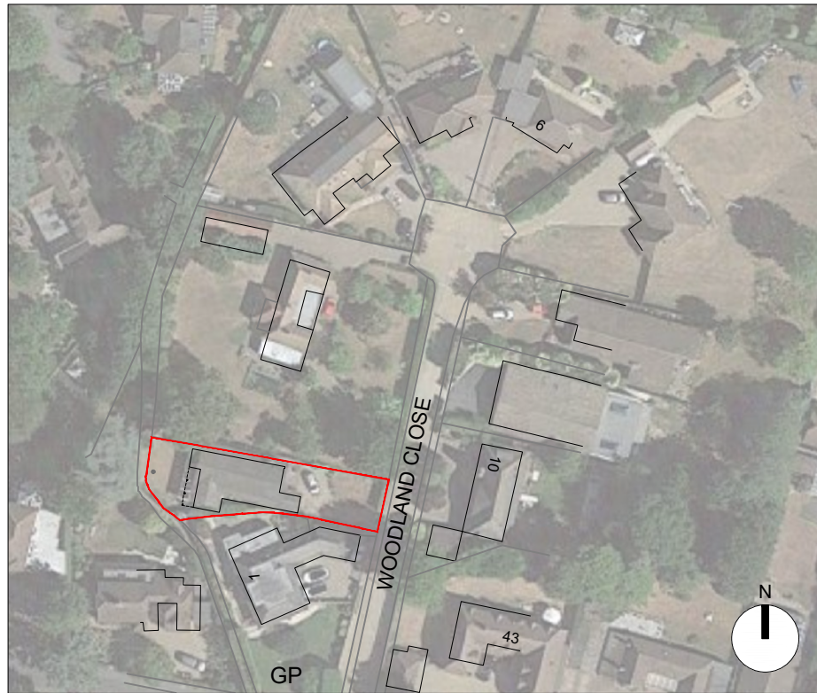
EXISTING AERIAL PLAN SCALE 1:1250 appx.