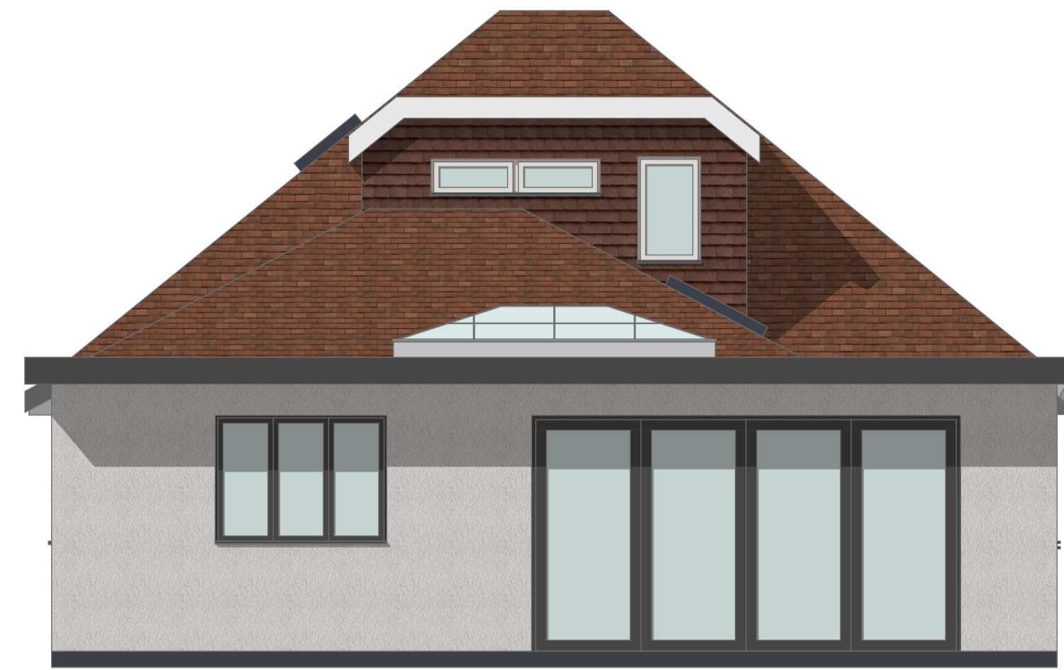
E-1 REAR ELEVATION 1:50