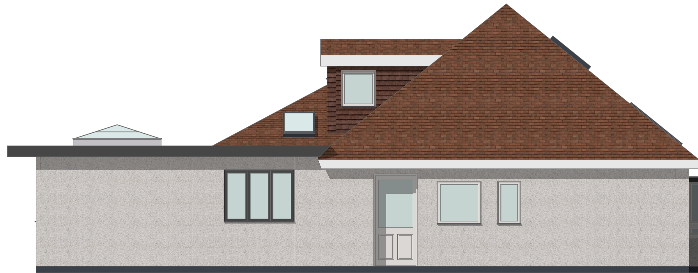
E-3 SIDE ELEVATION 1:50