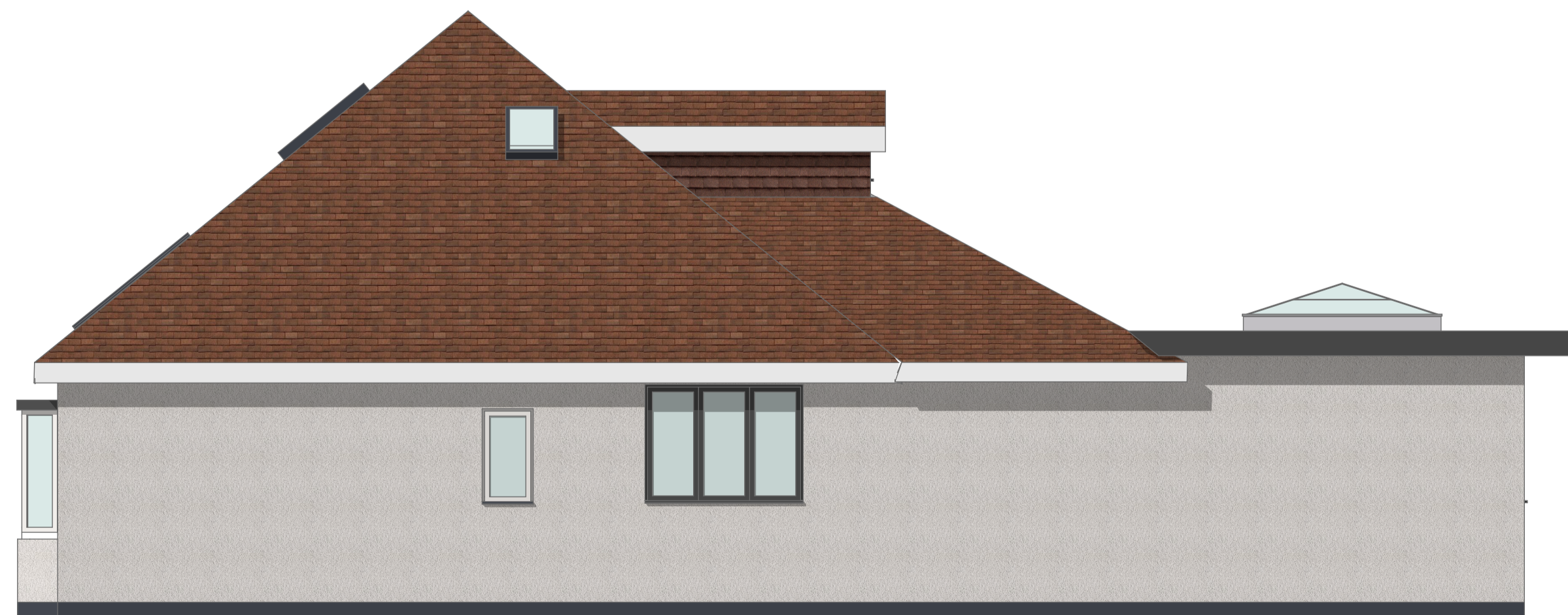
E-4 SIDE ELEVATION 1:50