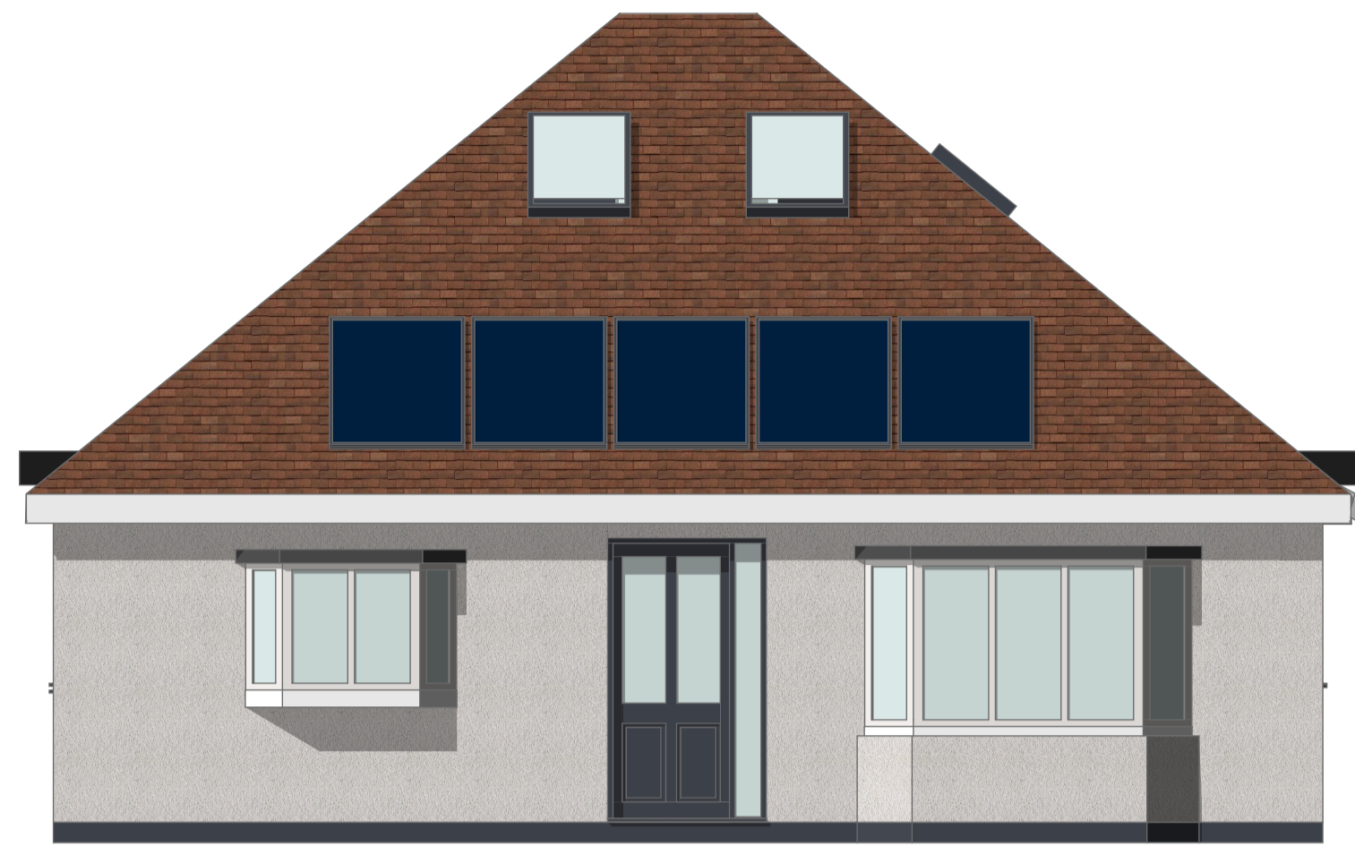
E-2 FRONT ELEVATION 1:50