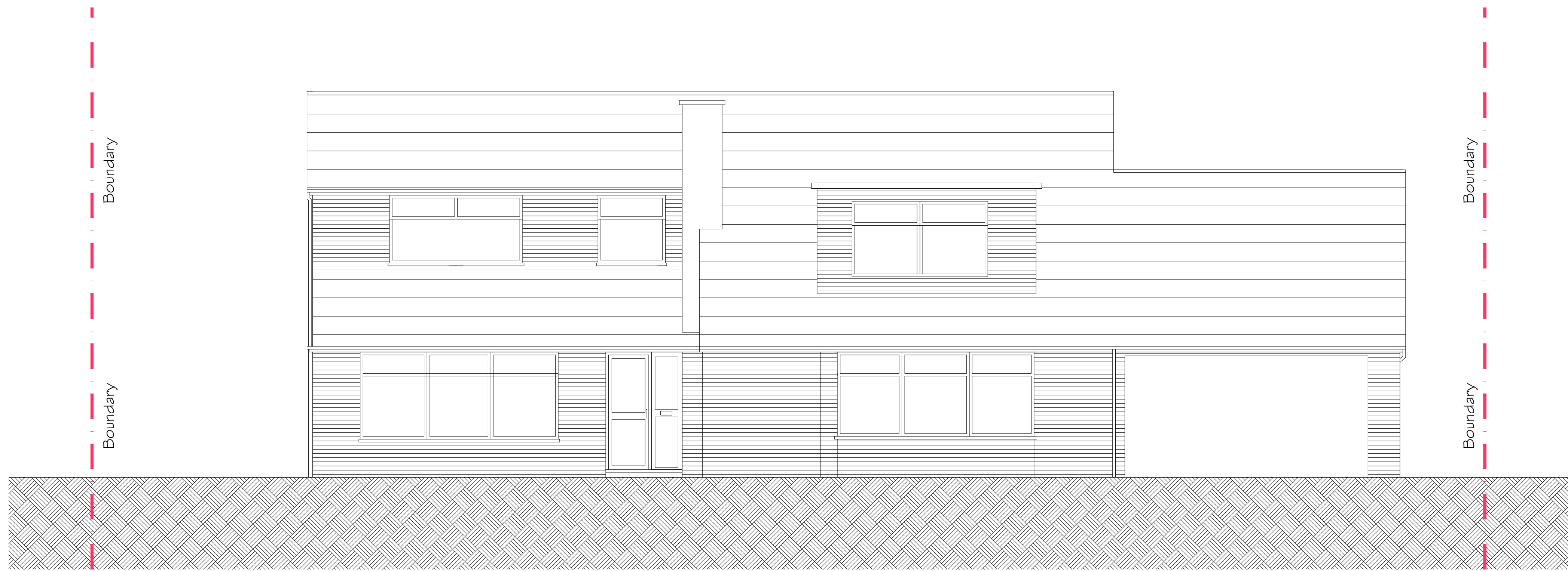
Existing Front Elevation 1:50 @A1