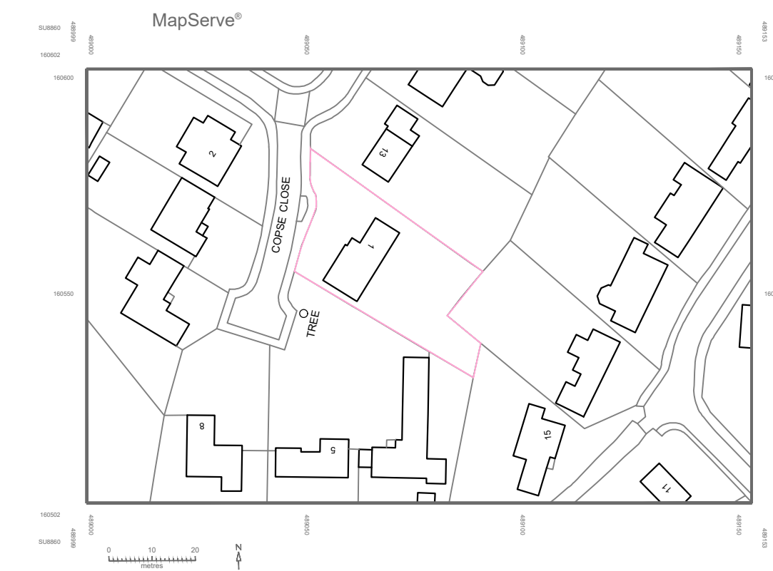
Site Location Plan 1:1250 @A1