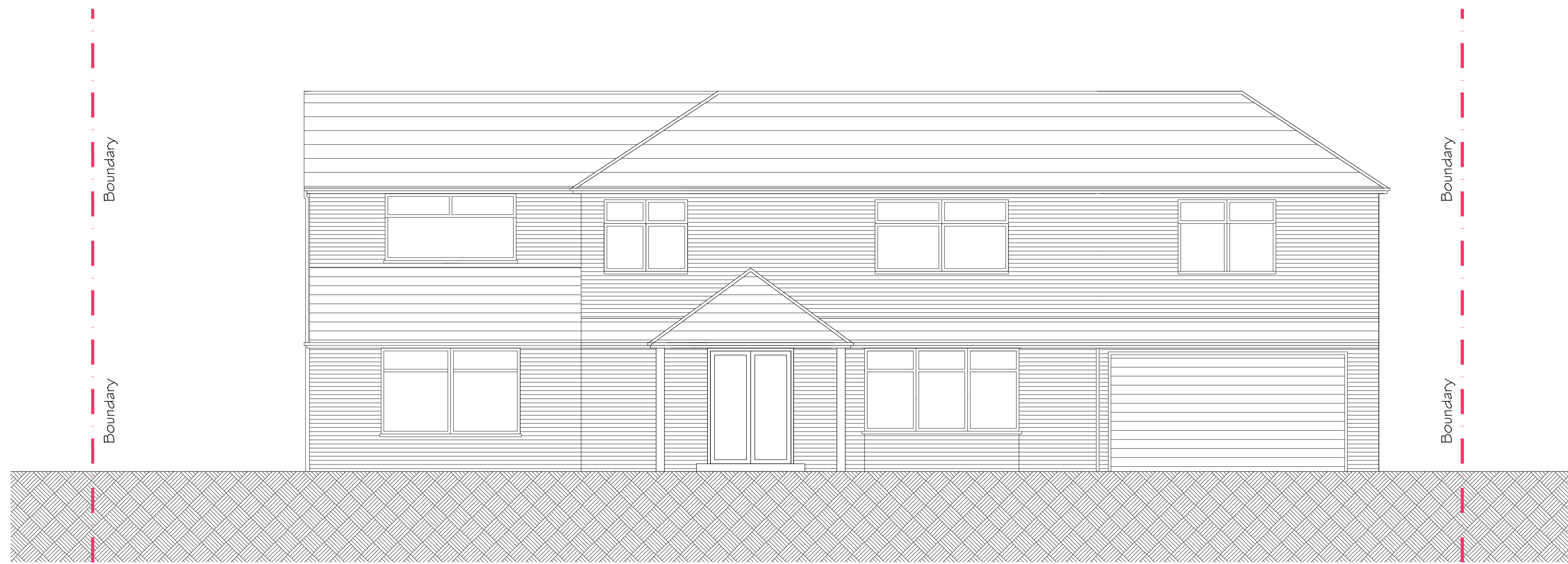
Proposed Front Elevation 1:50 @A1