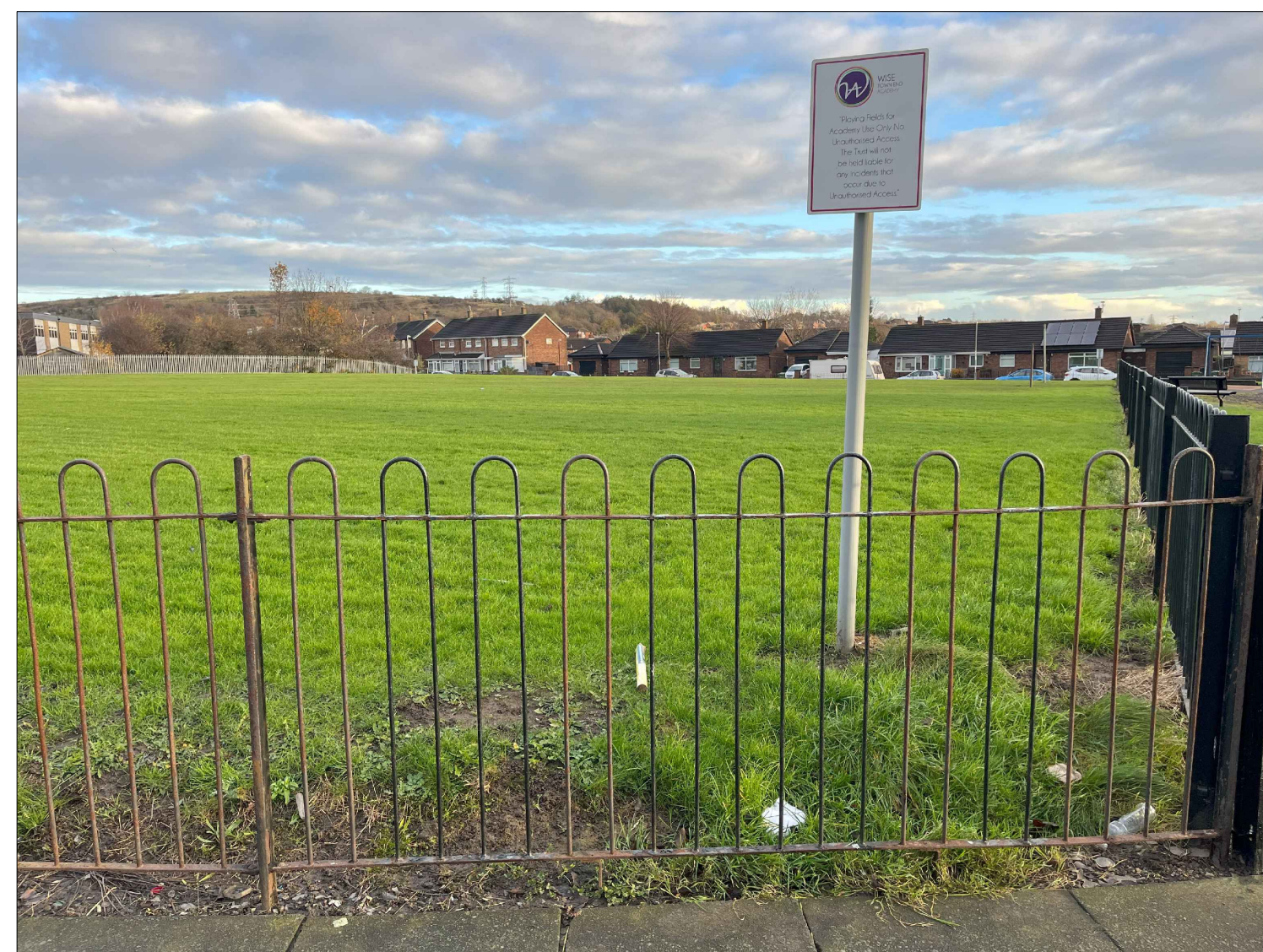
Existing Hoop Top Fencing