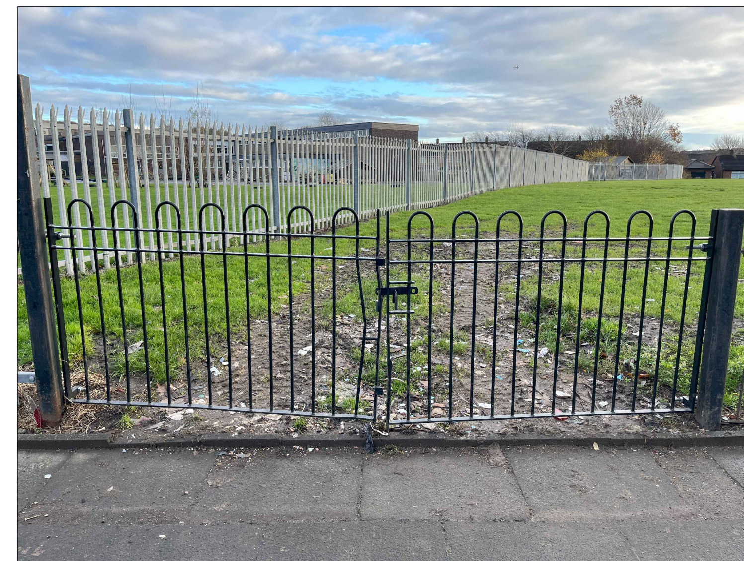
Existing Access Gate