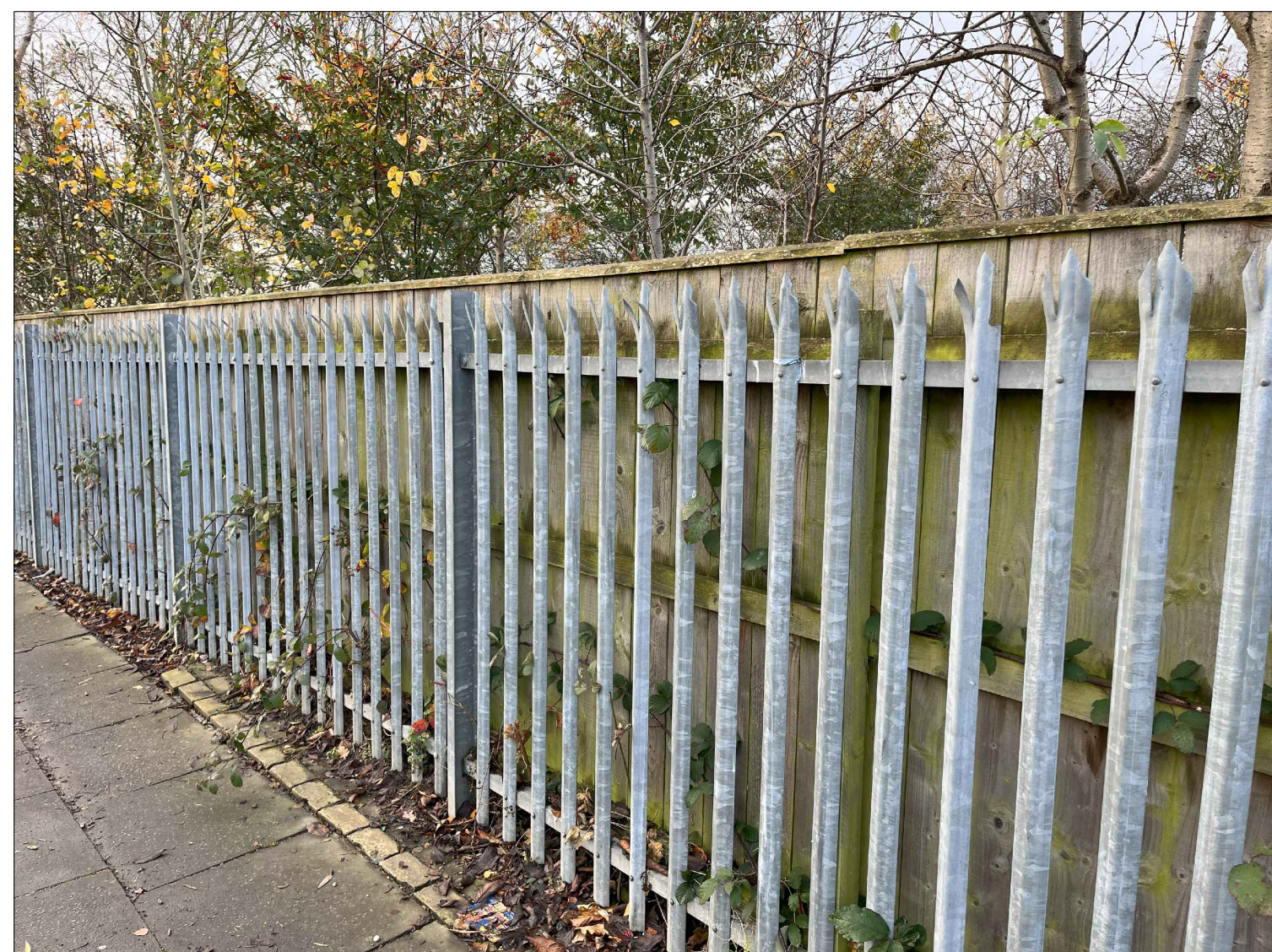
Existing Palisade Fencing