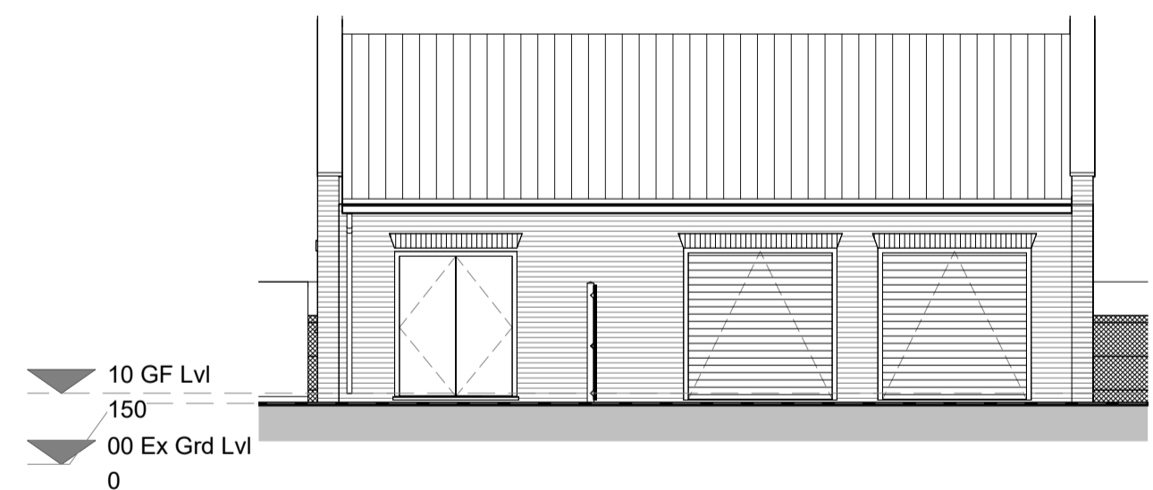
Garage West Elevation 1 : 100

NOTES Do not scale from this drawing. Only figured dimensions are to be taken from this drawing. The contractor must verify all dimensions on site before commencing any work or shop drawings. The contractor must report any discrepancies to the designer before commencing work. If this drawing exceeds the quantities taken in any way, the designer is to be informed before the work is initiated. Work within The Construction (Design and Management) Regulations 2020 is not to start until a Health and Safety Plan has been produced.