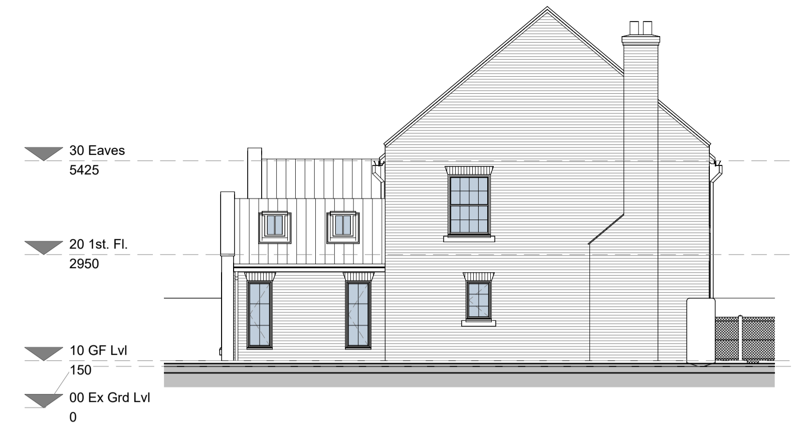
West Elevation 1 : 100