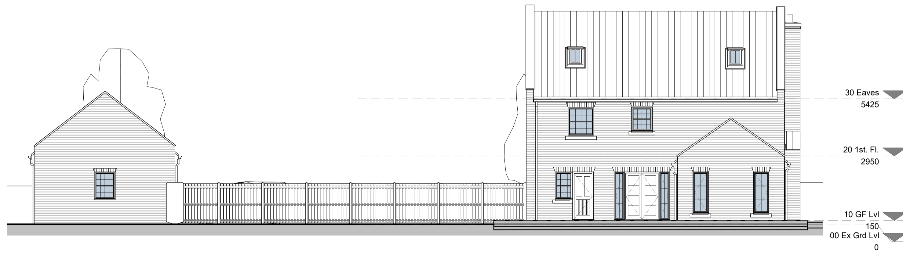
North Elevation 1 : 100