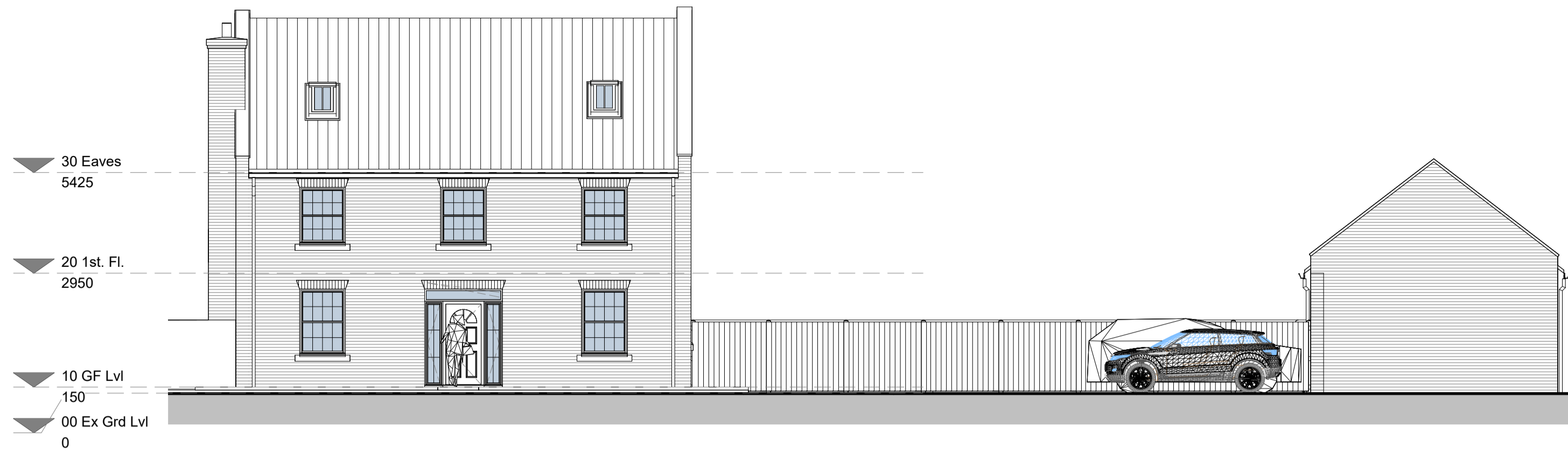
South Elevation 1 : 100