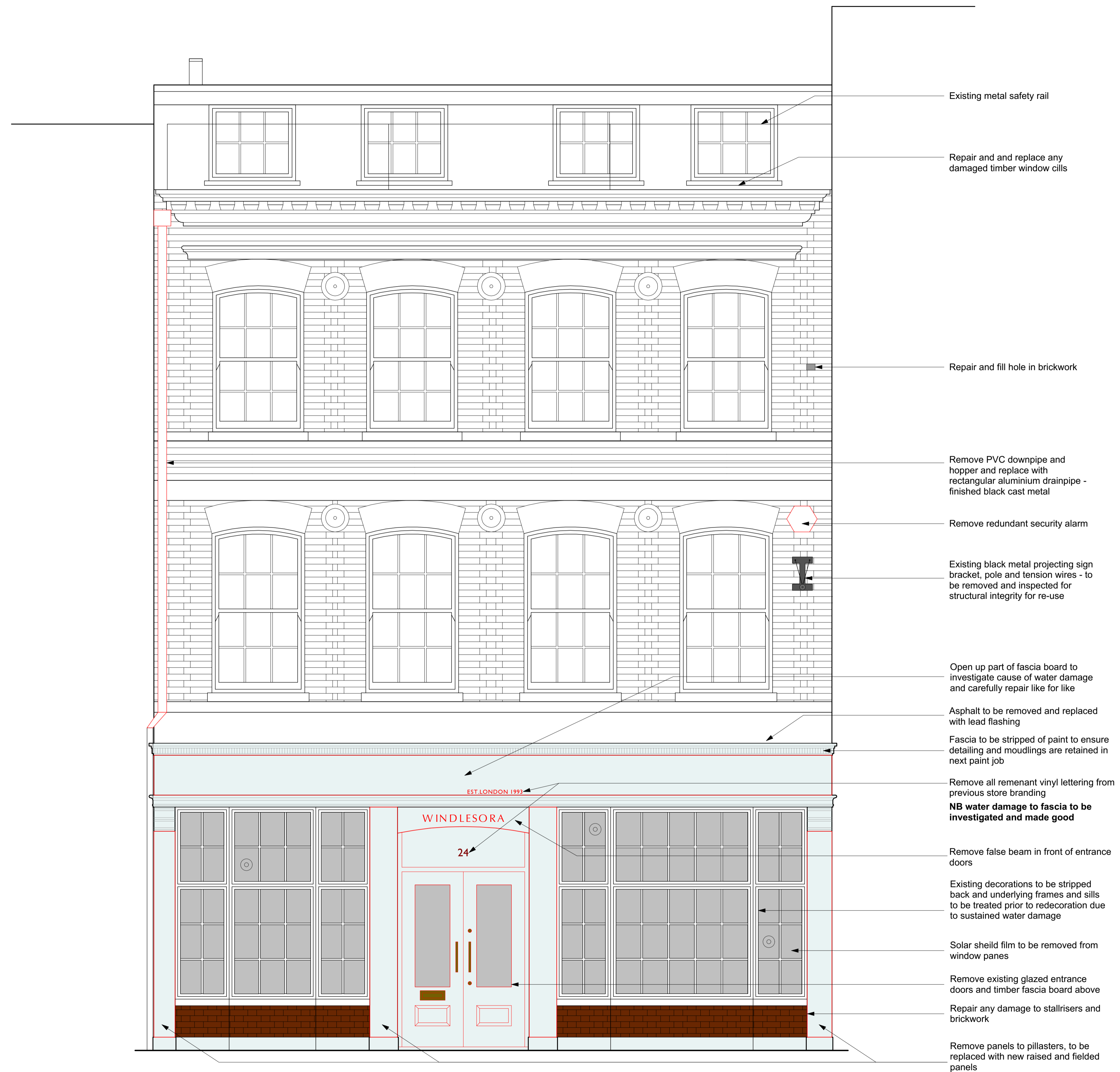
EXISTING EXTERNAL ELEVATION scale 1:25 @ A1 / 1:50 @ A3