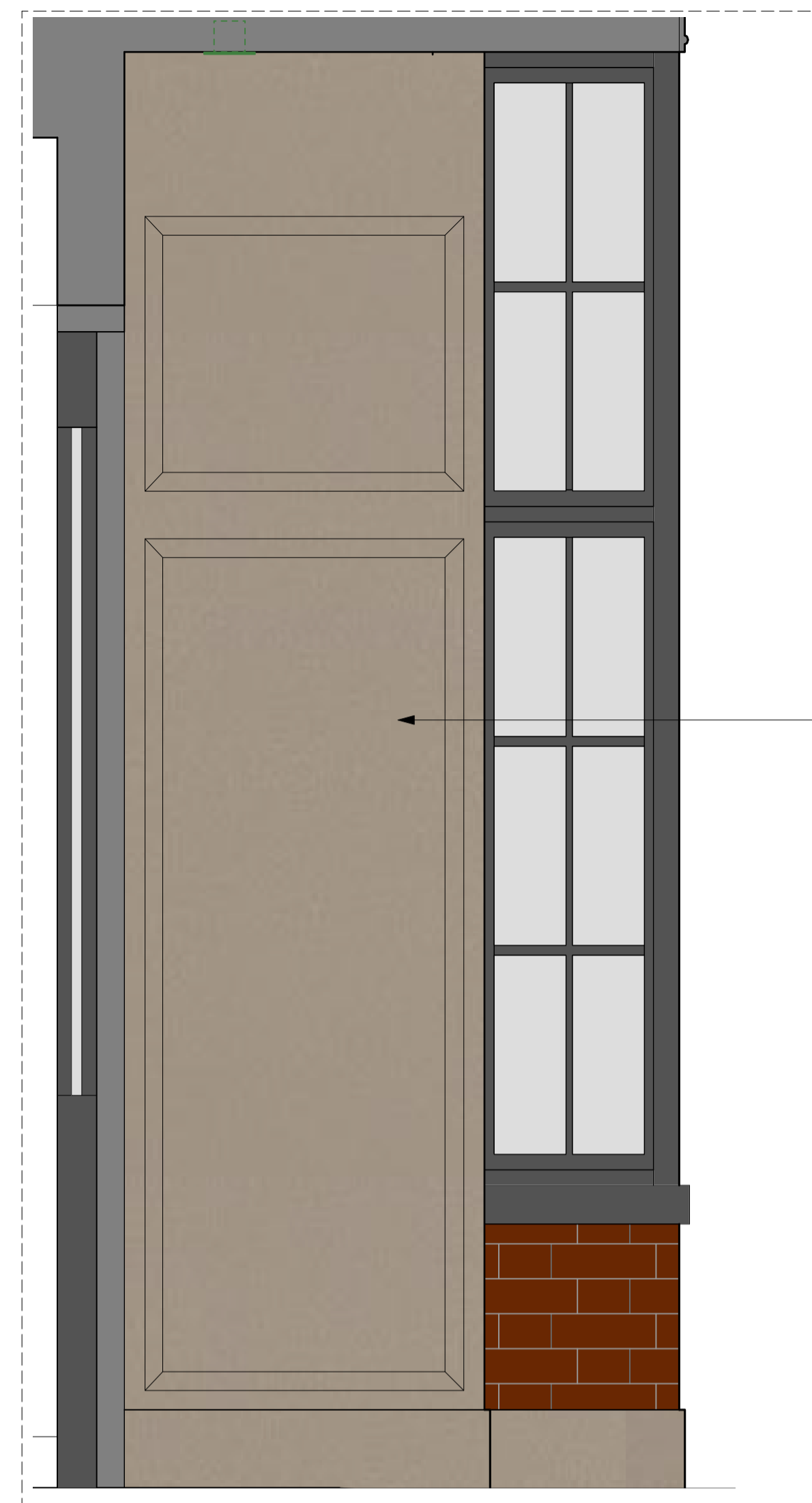
PROPOSED PANEL DETAIL scale 1:10 @ A1 / 1:20 @ A3