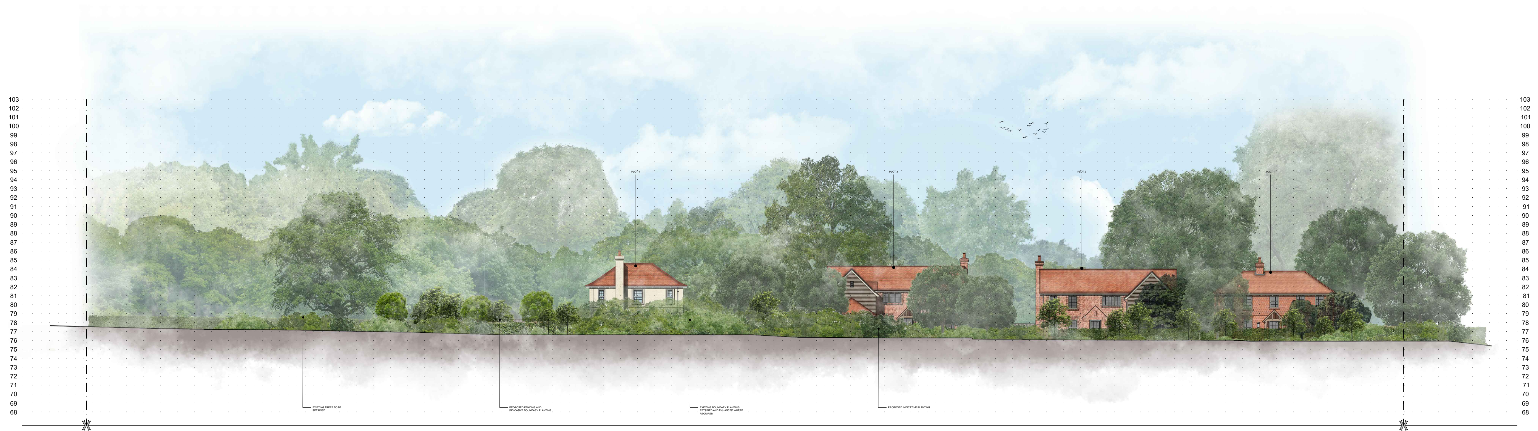
PROPOSED STREET SCENE A-A - (1:250)