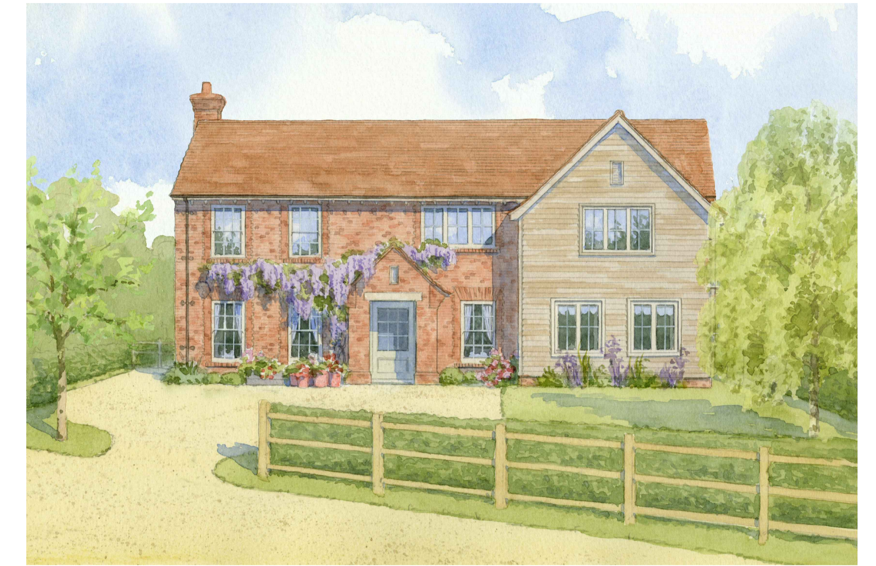
Plot 2 - Artists Impression