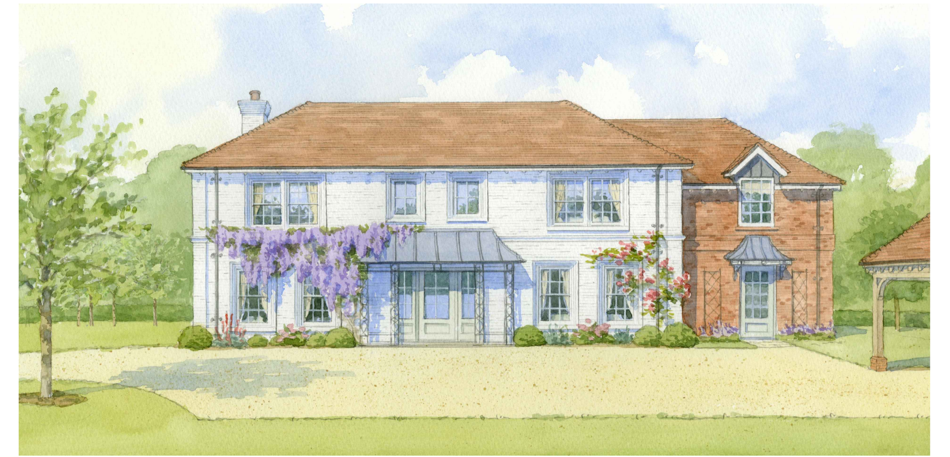
Plot 4 - Artists Impression