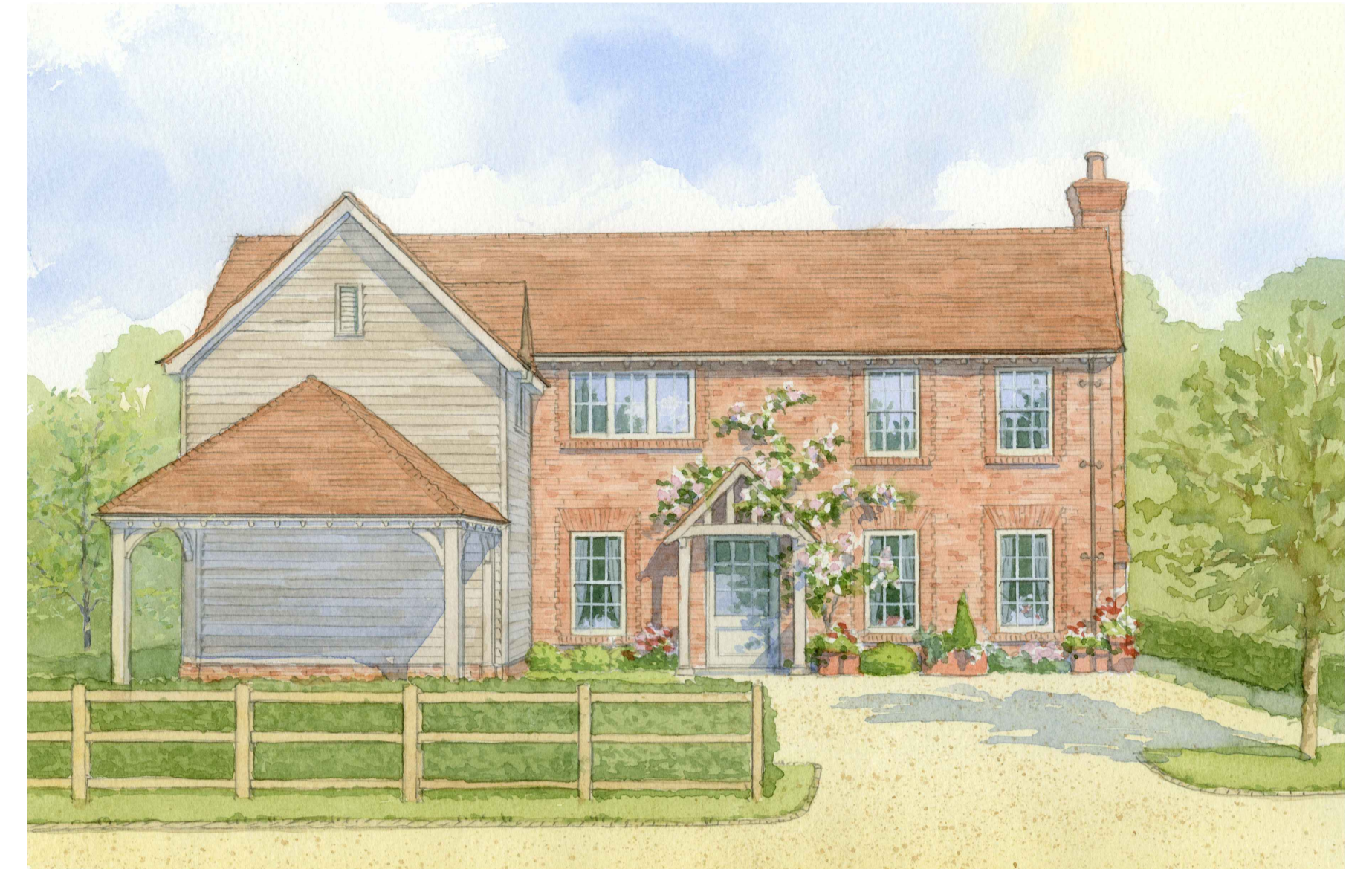
Plot 3 - Artists Impression