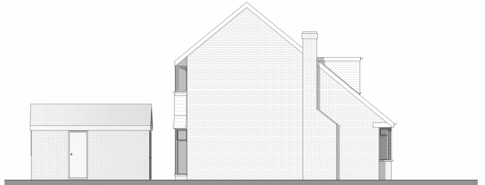
Side 1 Elevation