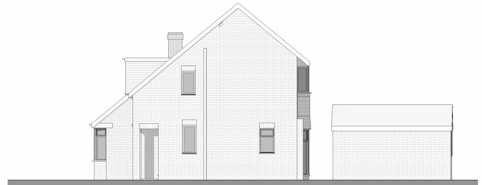
Side 2 Elevation