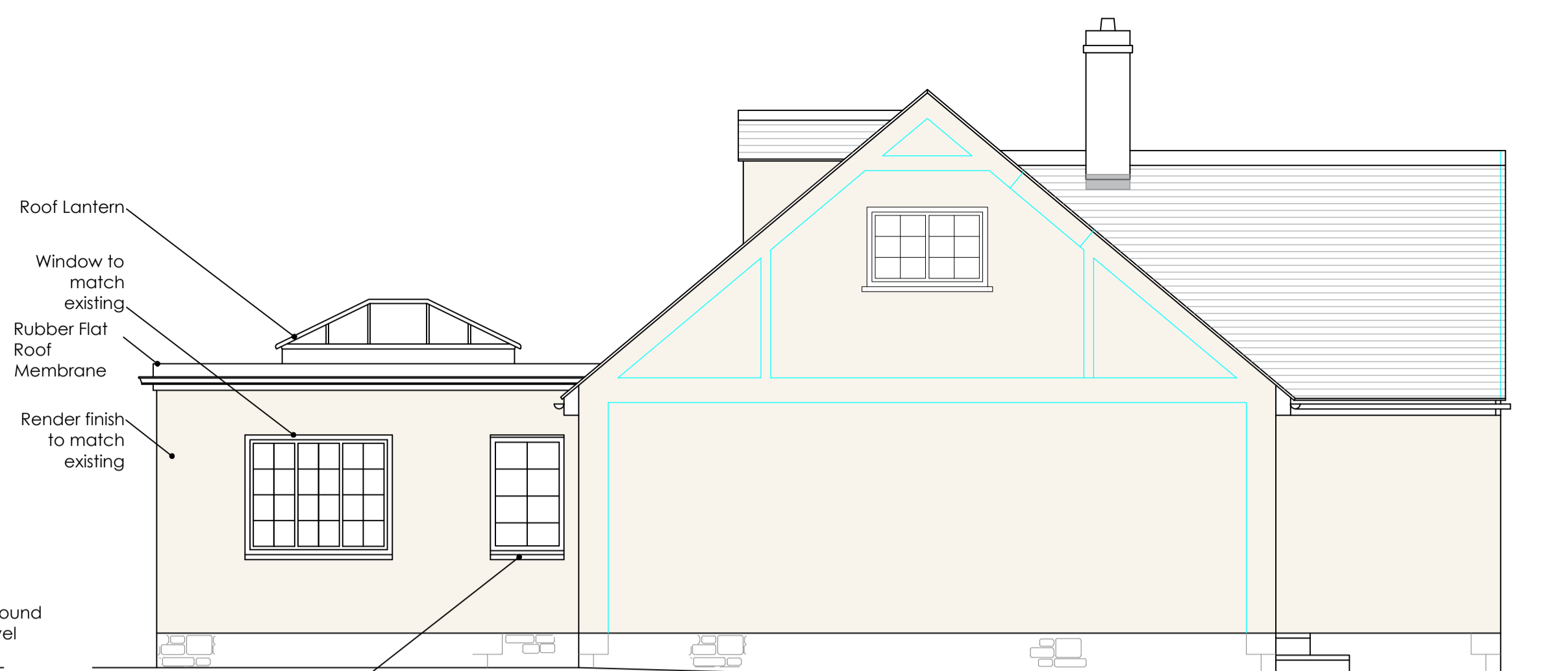
PROPOSED REAR ELEVATION 1:50