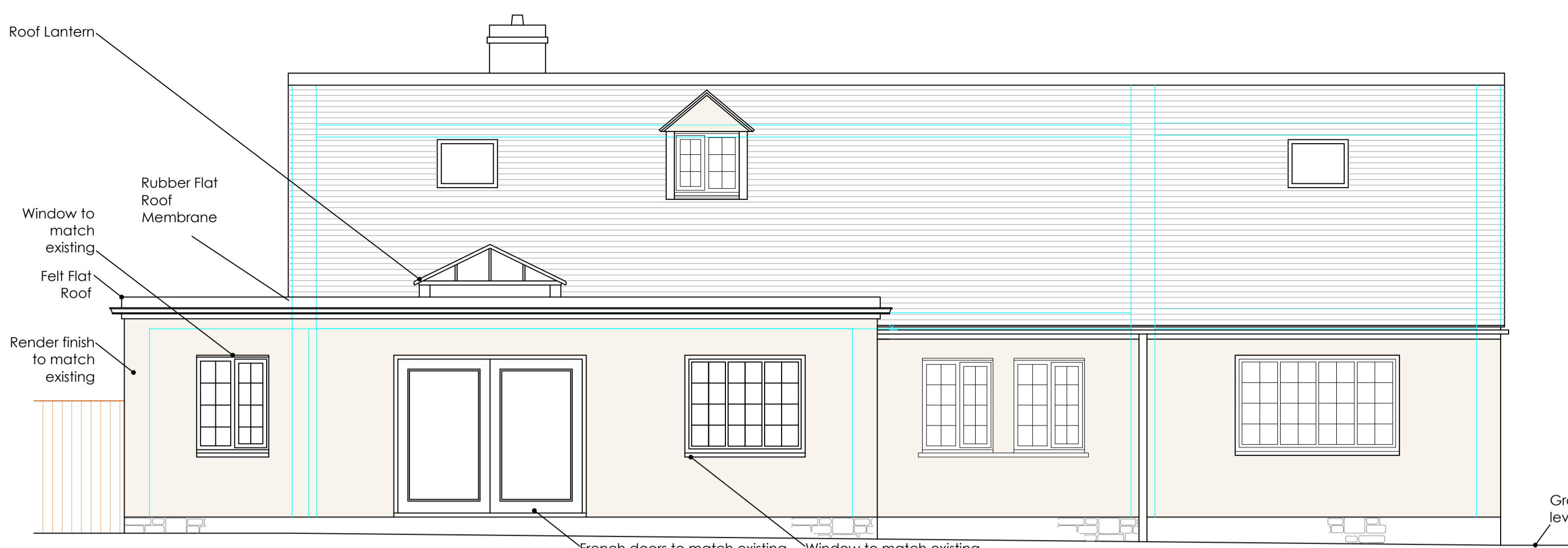
PROPOSED SIDE ELEVATION 1:50