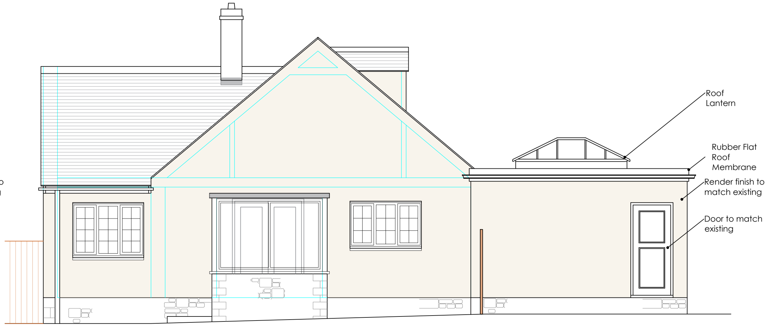
PROPOSED FRONT ELEVATION 1:50