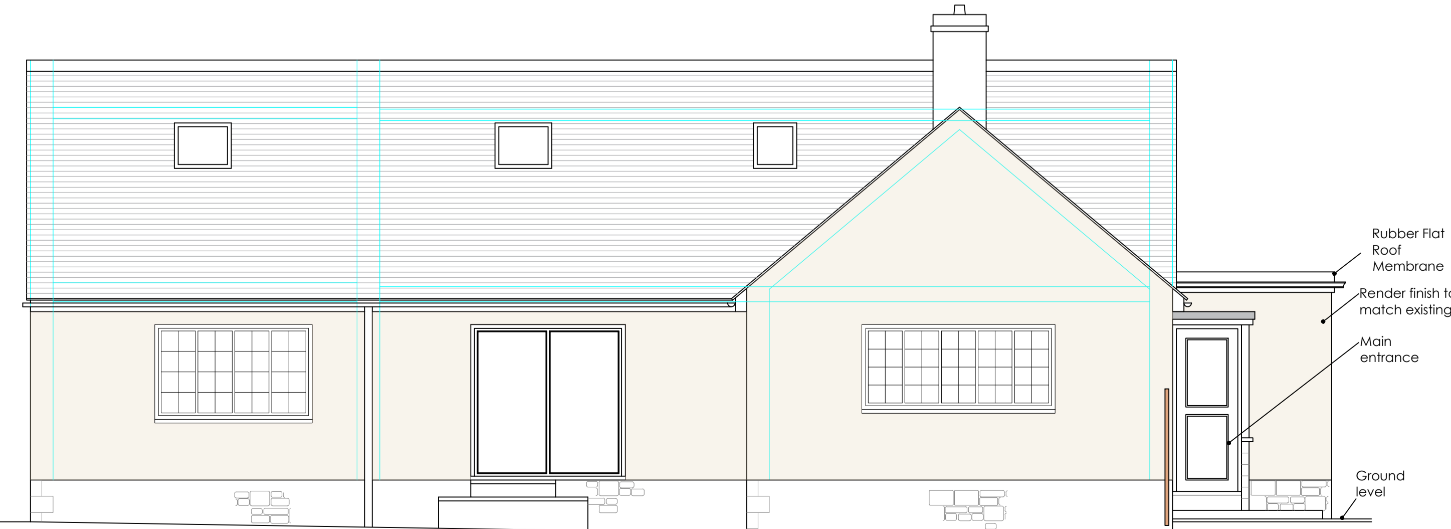
PROPOSED SIDE ELEVATION 1:50