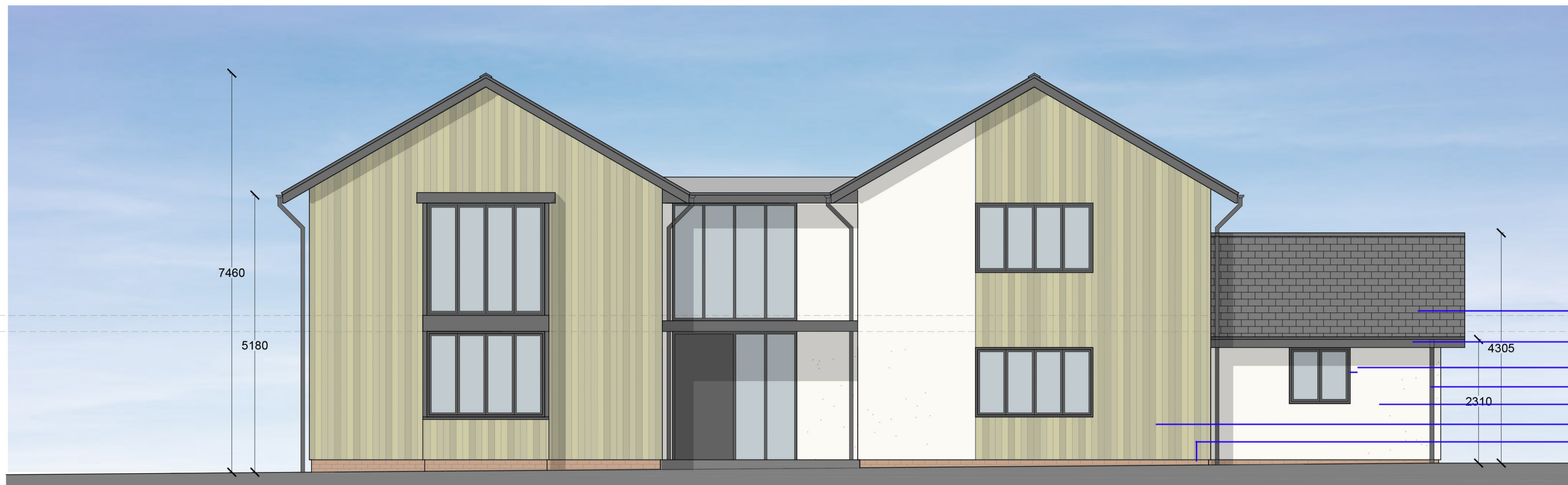
FRONT ELEVATION (SOUTH)

NOTE: Drawing to not be scale and written dimensions to be used only. Refer to drawing scale, paper size and scale bar.