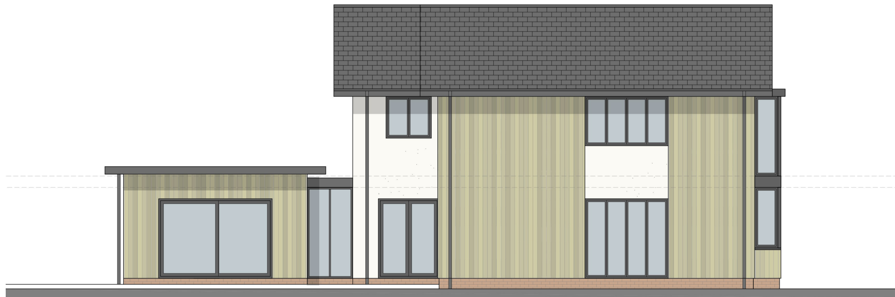
SIDE ELEVATION (WEST)