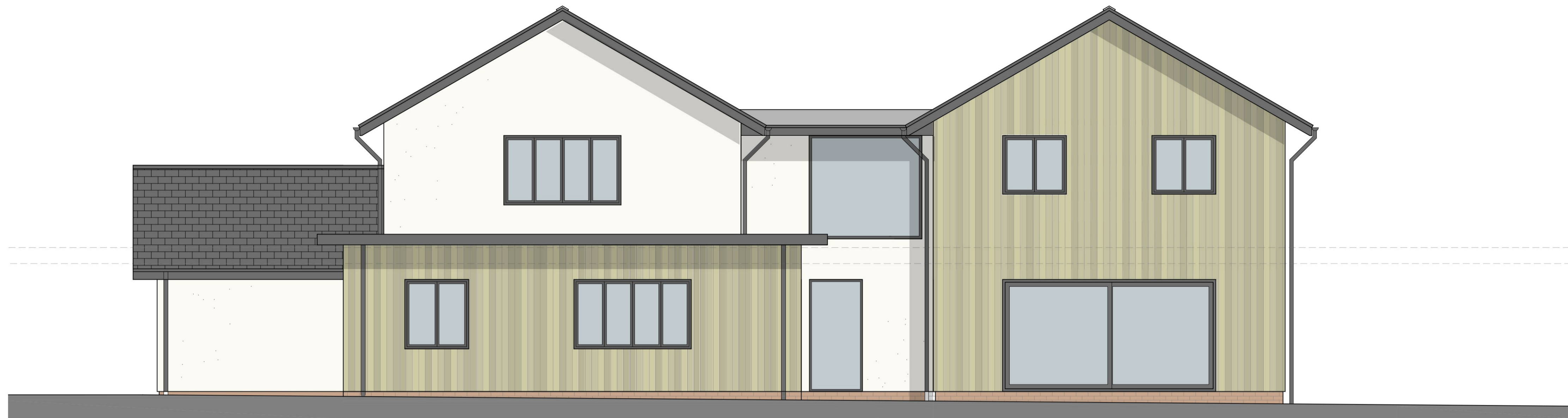
REAR ELEVATION (NORTH)

NOTE: Drawing to not be scale and written dimensions to be used only. Refer to drawing scale, paper size and scale bar.