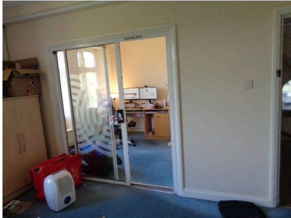
Glazed sliding doors to be removed

Removal of sliding doors between bedrooms 2 and 3 to form separate bedrooms