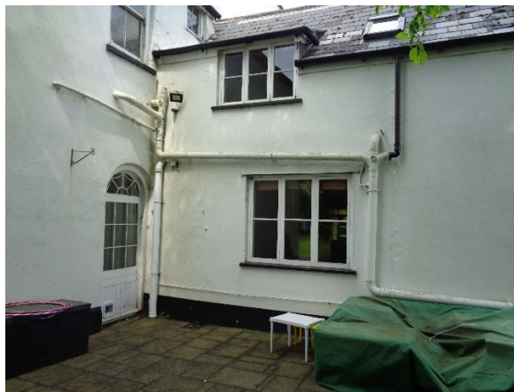
Existing window to be replaced with French windows

To the rear of the south elevation, facing the garden, a new window will be inserted into the wall of the kitchen. Conservation roof windows will also be inserted in the tiled roof to the kitchen area. The existing window in the breakfast room will be replaced with French windows to allow direct access from the breakfast room to the garden.