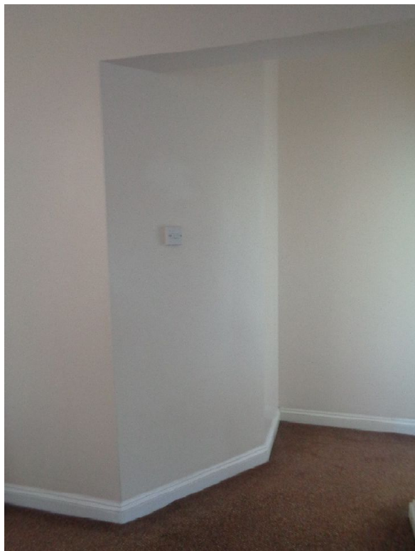
Cranked stud wall between landing and bedroom 3 to be removed

Removal of cranked modern stud wall and dividing wall to enlarge bedroom 3