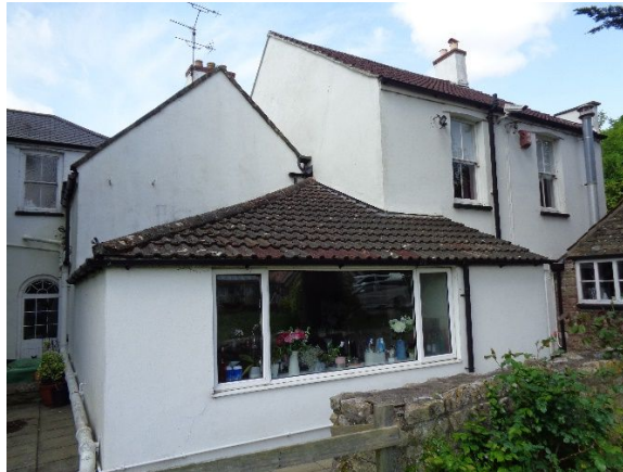
Rear extension – large uPVC window to be removed

At the rear of the building a large modern uPVC window to the kitchen area will be removed and the opening blocked up with rendered finish to match existing.