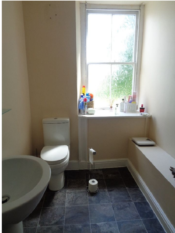
Part of existing bathroom side walls to be removed

Part removal of side walls to existing bathroom to form larger en-suite bathroom and dressing room to bedroom 1 and additional wc off raised first floor landing