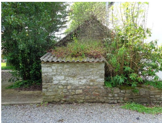
Store to be demolished

A new boundary wall with wrought iron fencing will be erected along the access drive to divide Lancaster House from the adjoining complex. The existing small stone store which has an asbestos cement roof will be demolished to form an access path between the new boundary wall and the house. The stone from the store and a low stone wall at the rear of the house, which will also be demolished, will be reclaimed for use in the new boundary wall.