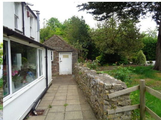
Low stone wall to be demolished