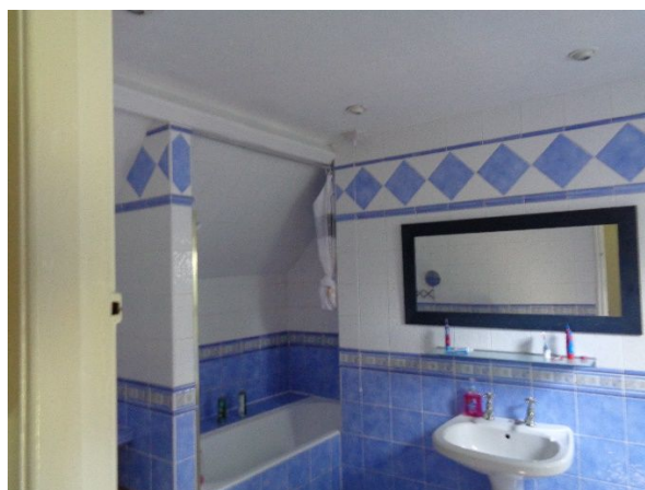
Existing chimney breast in family bathroom

Taking out part of disused chimney breast above breakfast area to allow rearrangement of family bathroom