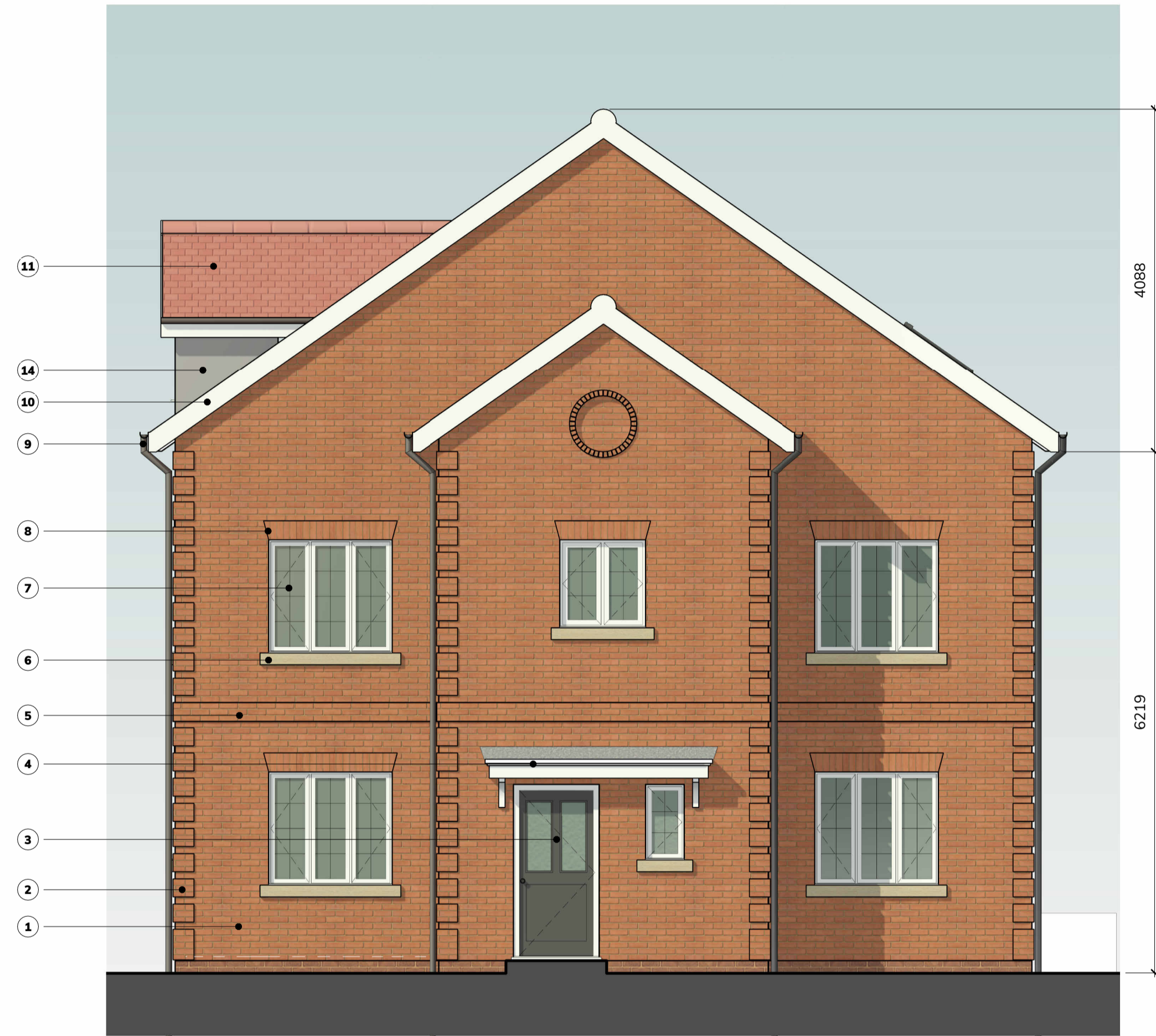
1 Elevation Front - Type A3 1:50