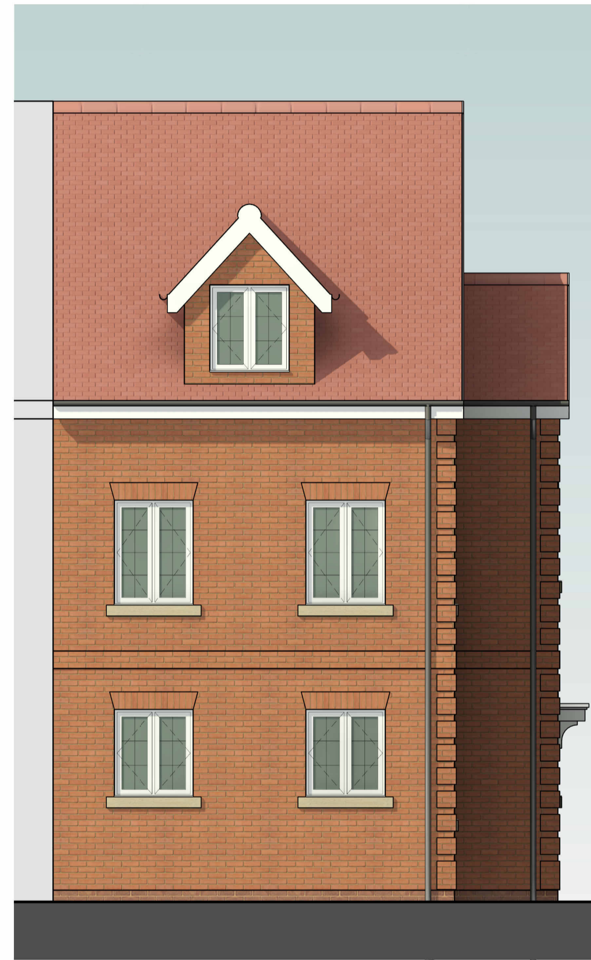
2 Elevation Side 1 - Type A3 1:50