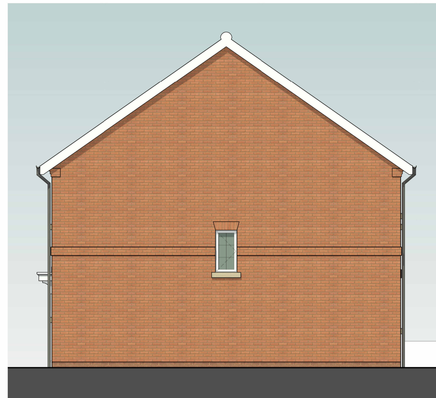
4 Elevation Side B - Type C - Detached 1:50