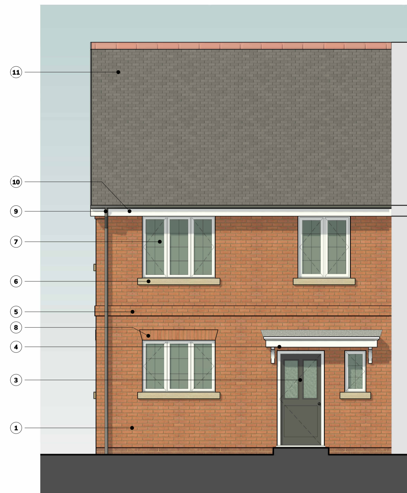
1 Elevation Front - Type C 1:50