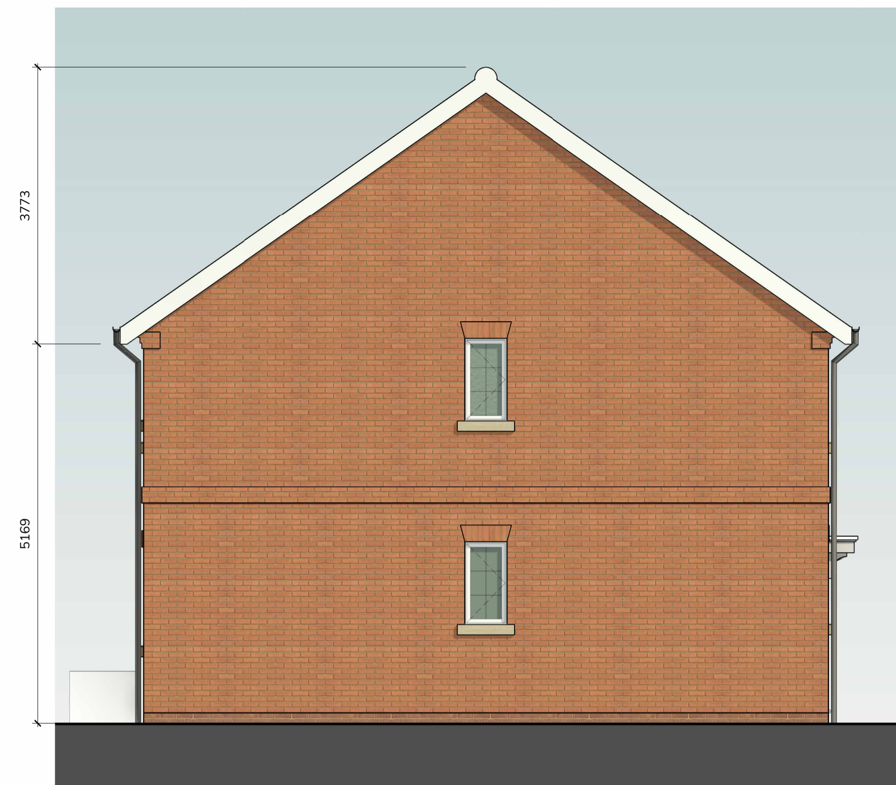
2 Elevation Side A - Type C 1:50