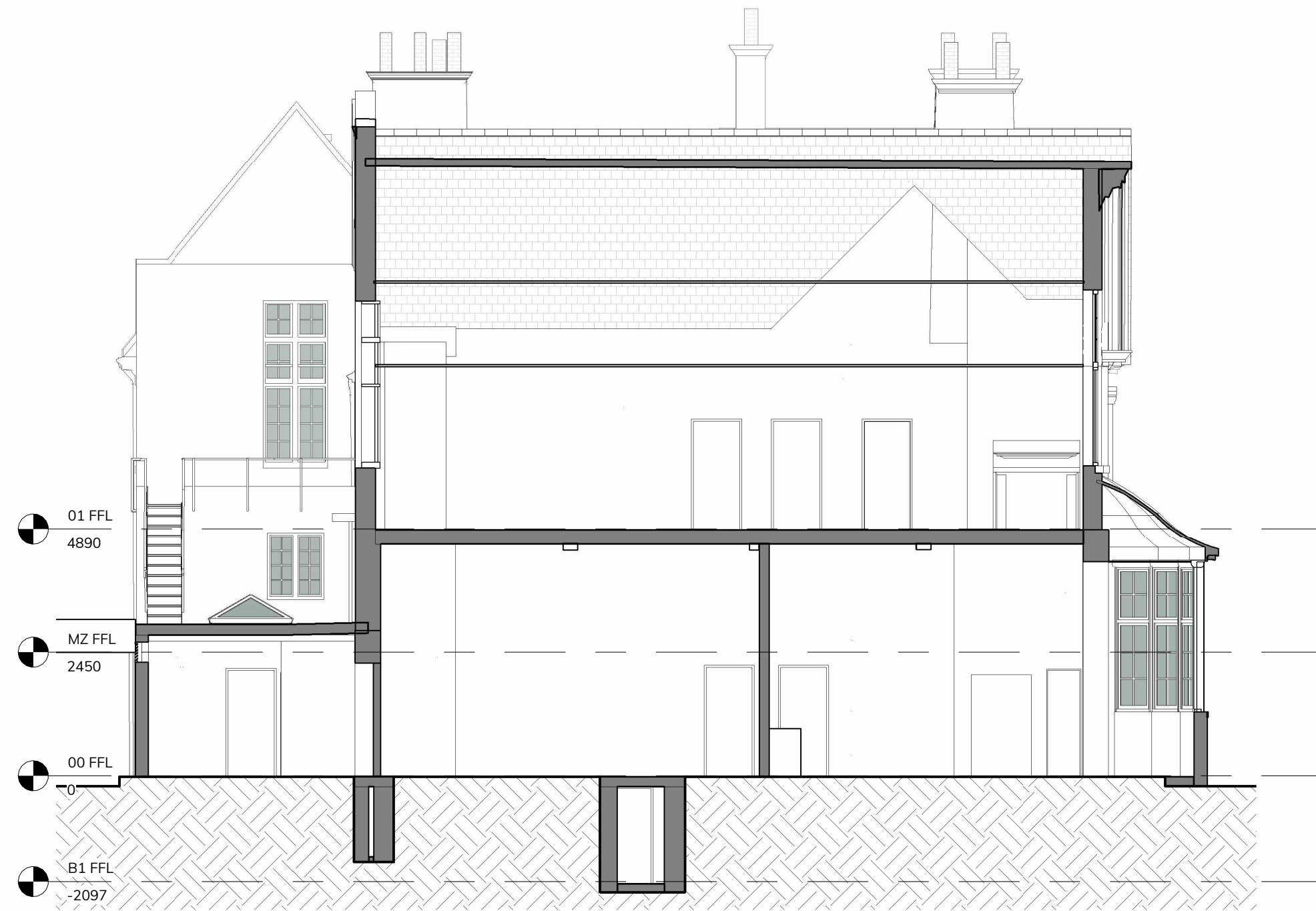
D GA Section D Existing 1 : 100