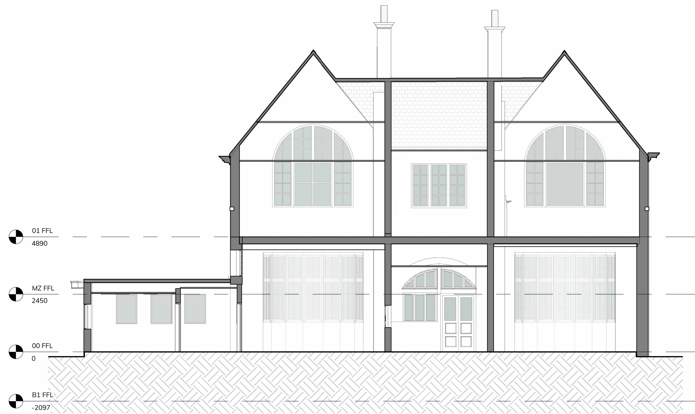
B GA Section B Existing 1 : 100