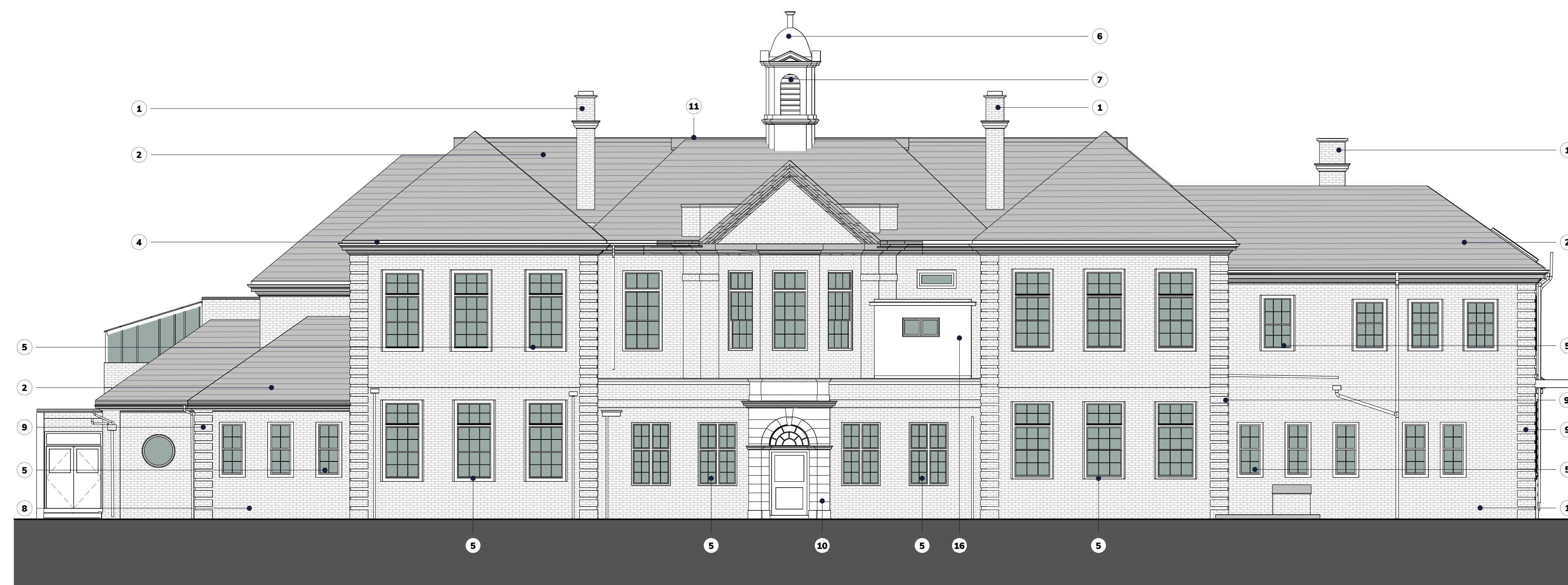
E GA Elevation East Existing 1:100