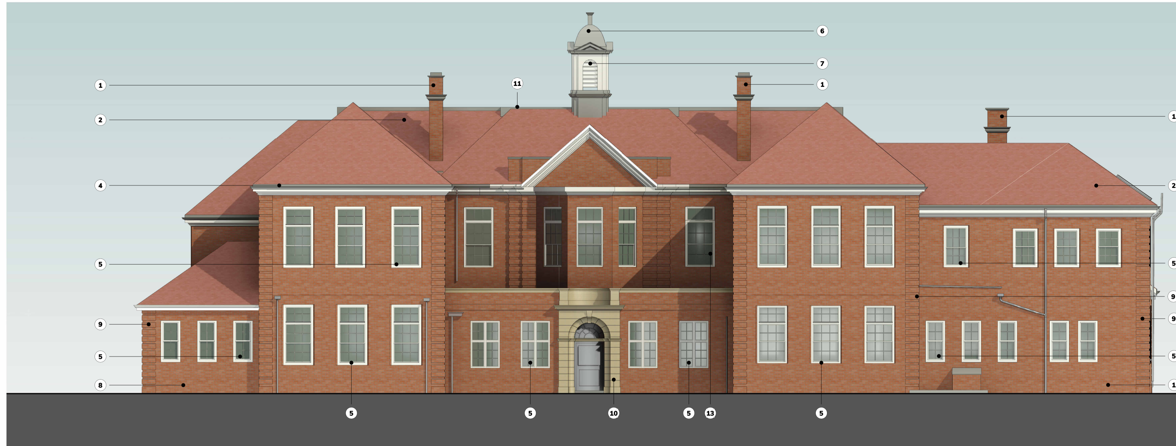
E GA Elevation East Proposed 1:100