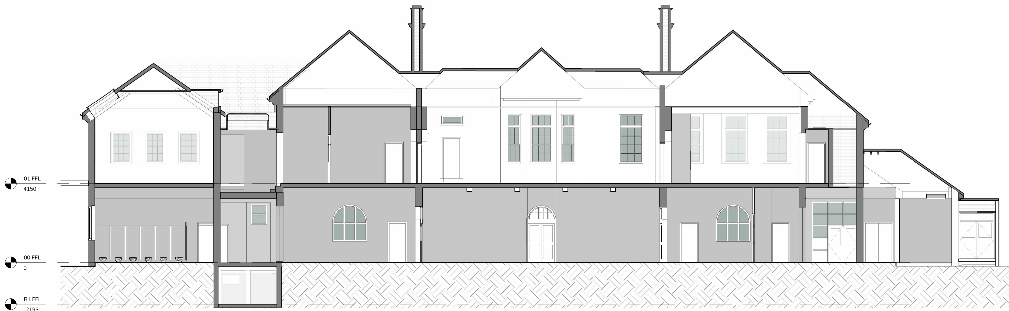
E GA Section E Existing 1 : 100