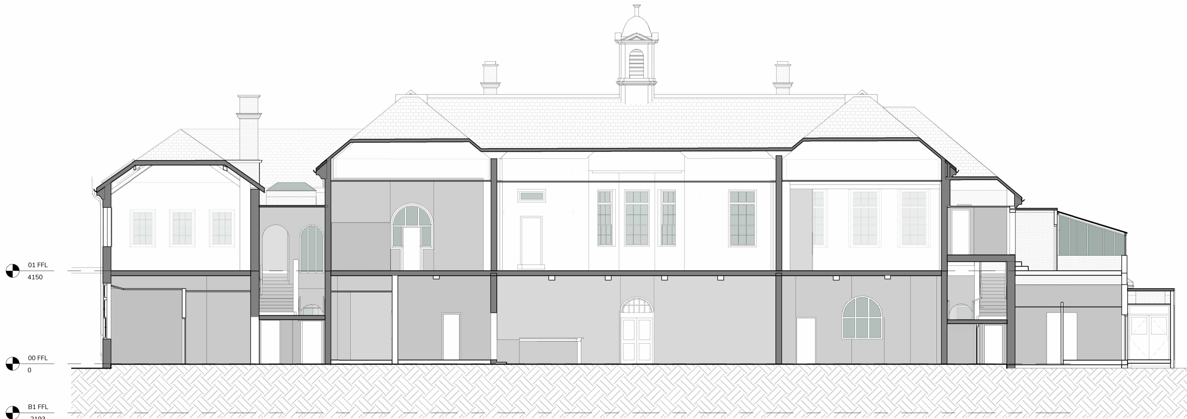
D GA Section D Existing 1 : 100