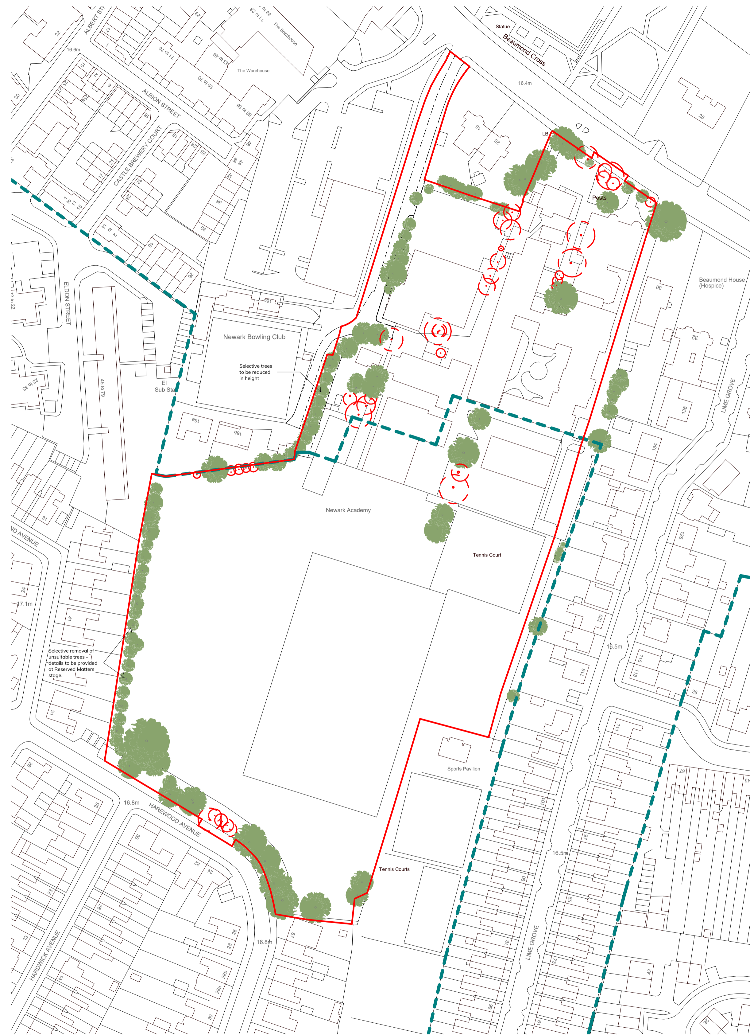
1 Tree Removal Plan 1 : 1000