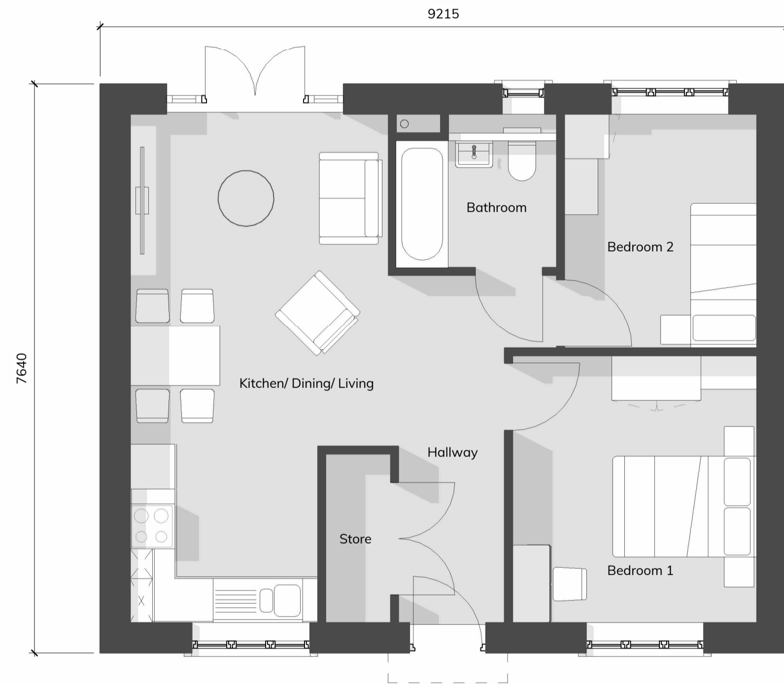
1 GA Plan Level 00 Ground Floor - Type E 1:50