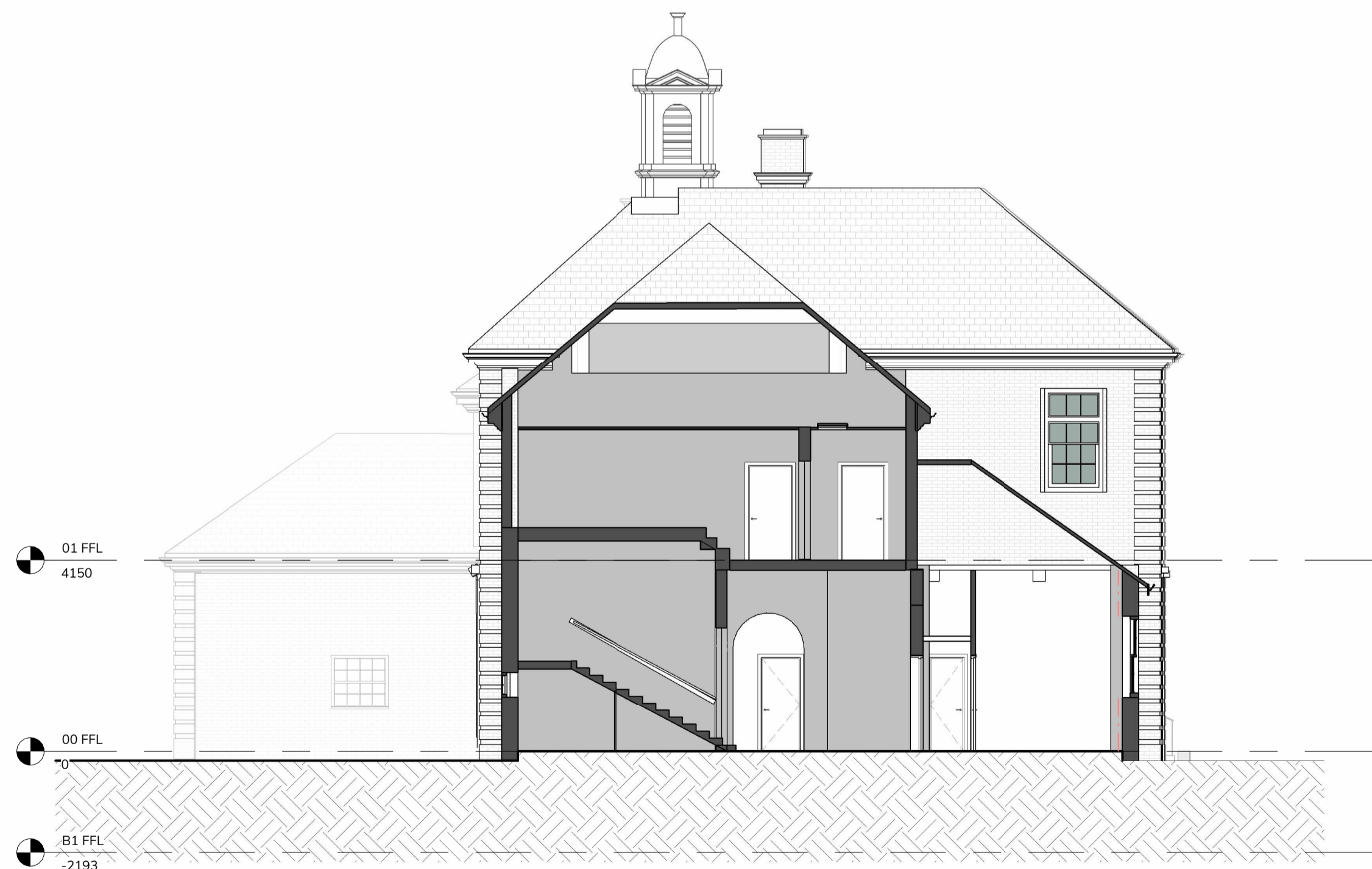
C GA Section C 1:100