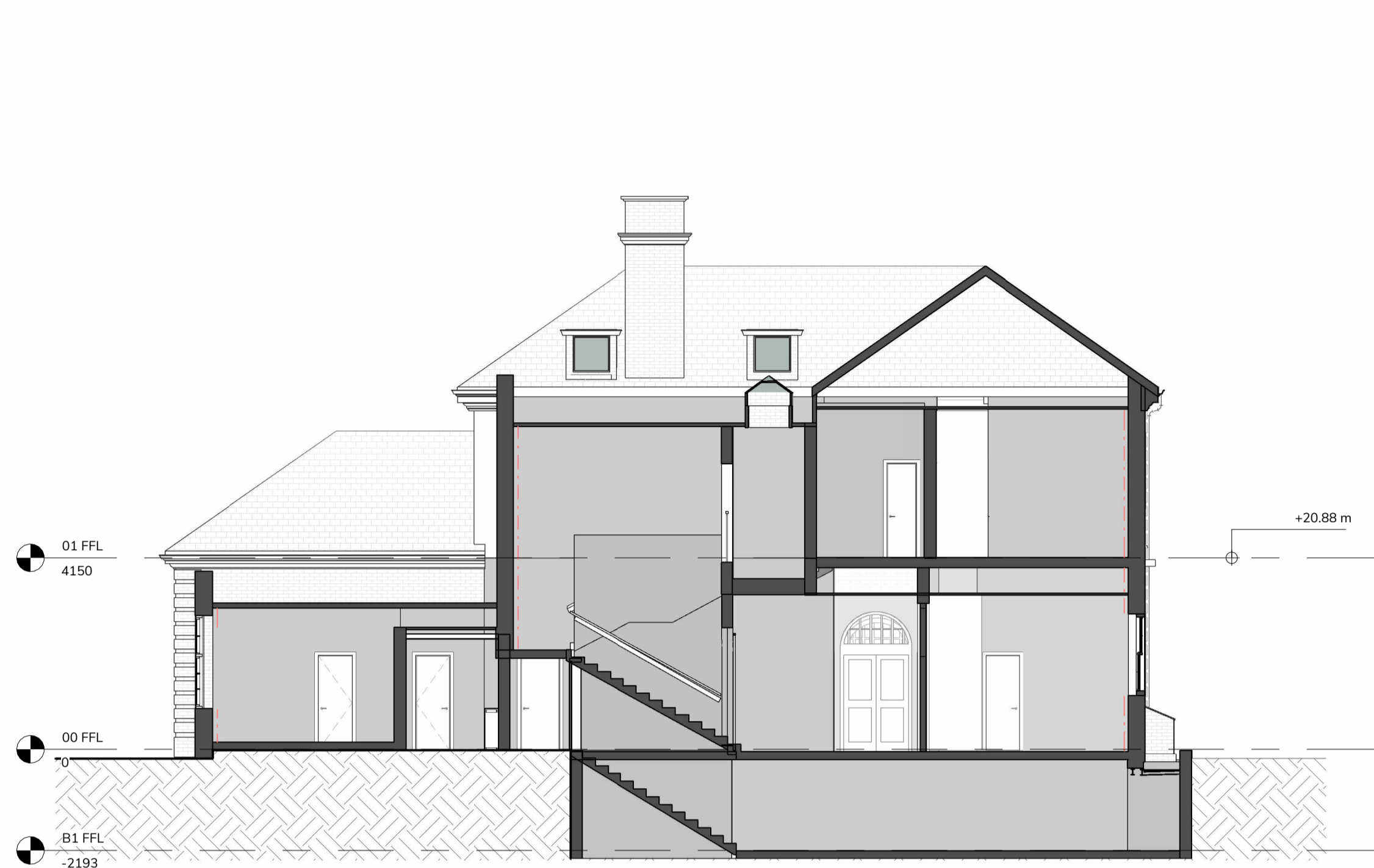
A GA Section A 1:100