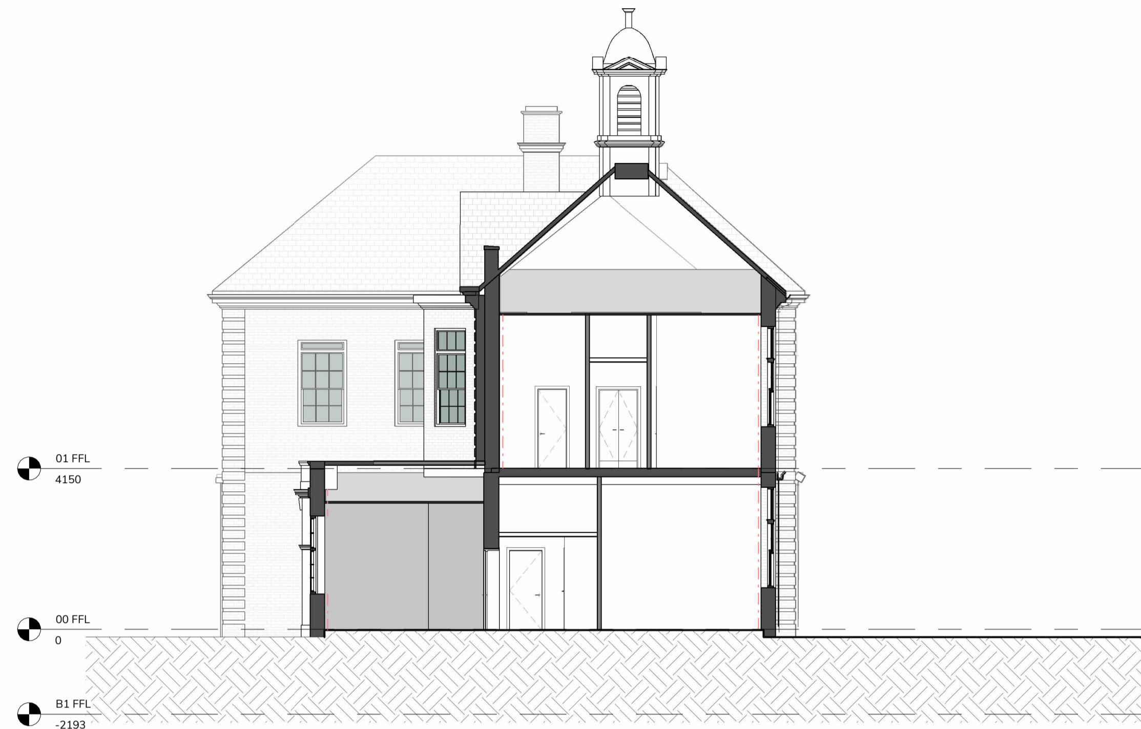
B GA Section B 1:100