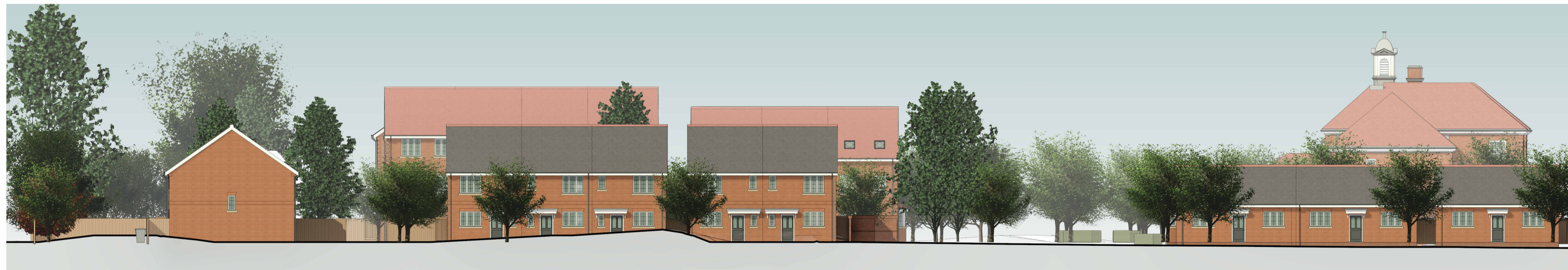
2 Detailed Street Elevation E 1 : 200