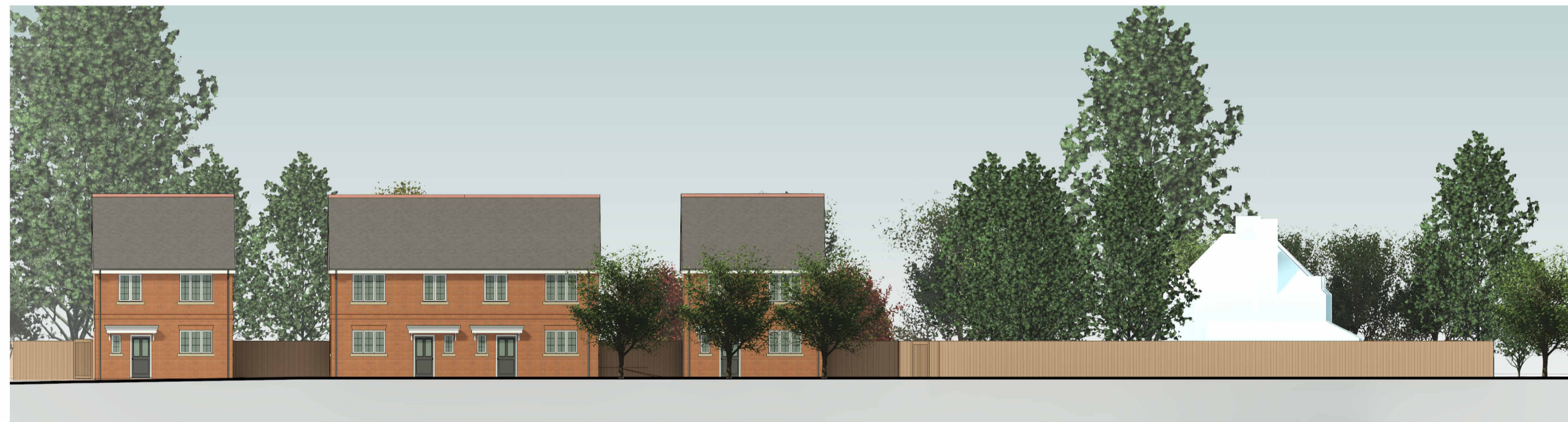
3 Detailed Street Elevation F 1 : 200