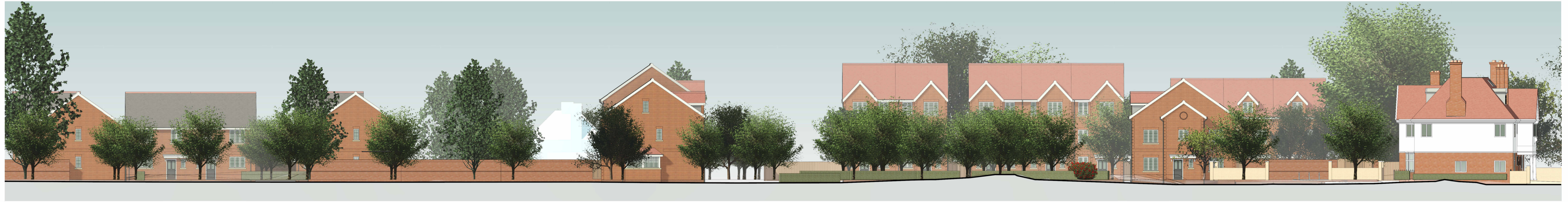
1 Detailed Street Elevation D 1 : 200