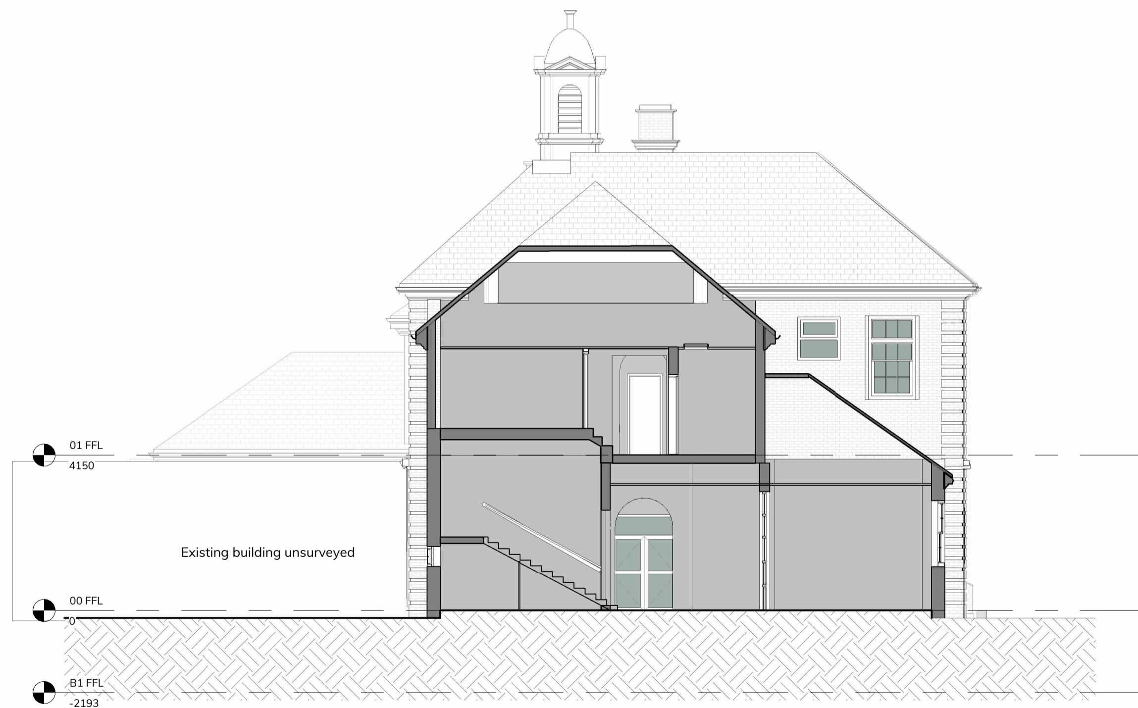
C GA Section C Existing 1 : 100