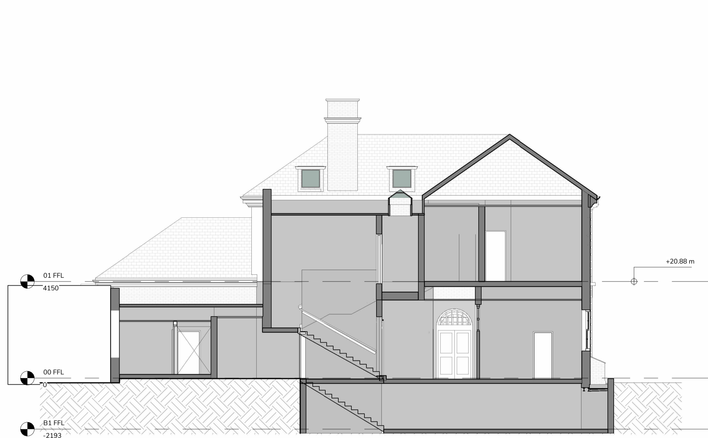
A GA Section A Existing 1 : 100