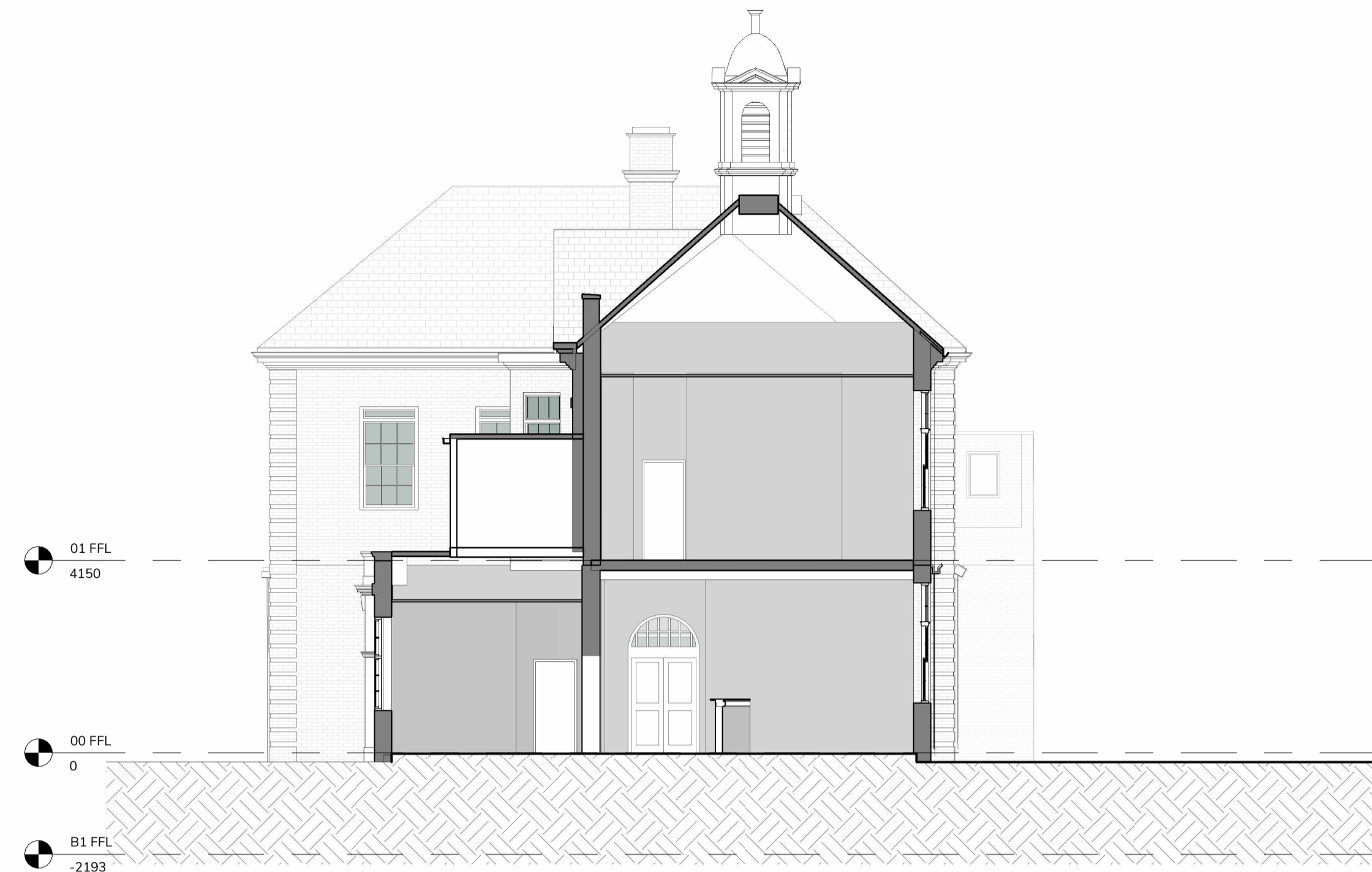
B GA Section B Existing 1 : 100