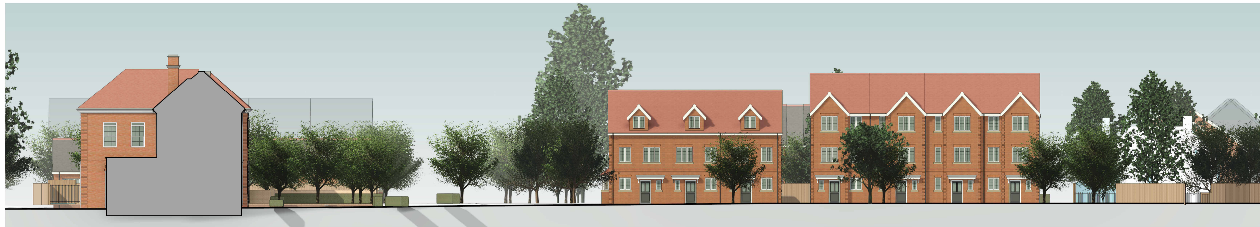
3 Detailed Street Elevation C 1 : 200