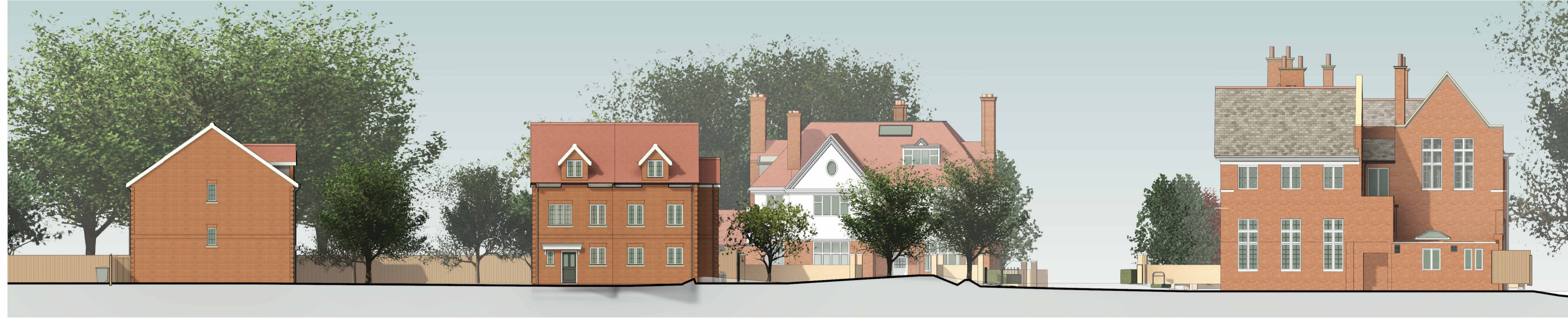
1 Detailed Street Elevation A 1 : 200