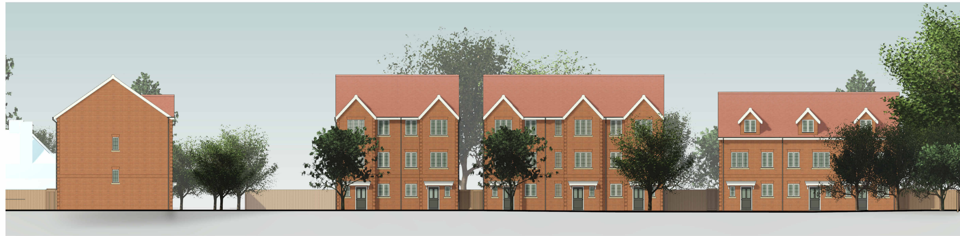
2 Detailed Street Elevation B 1 : 200