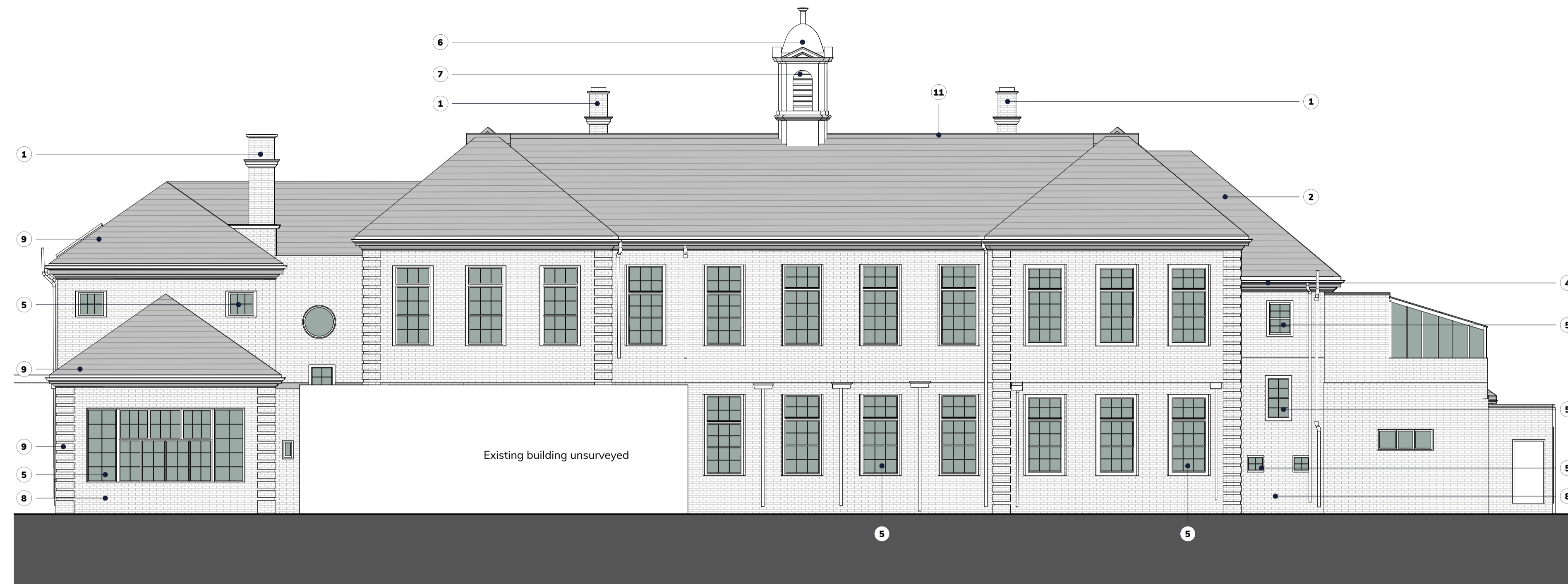
W GA Elevation West Existing 1:100