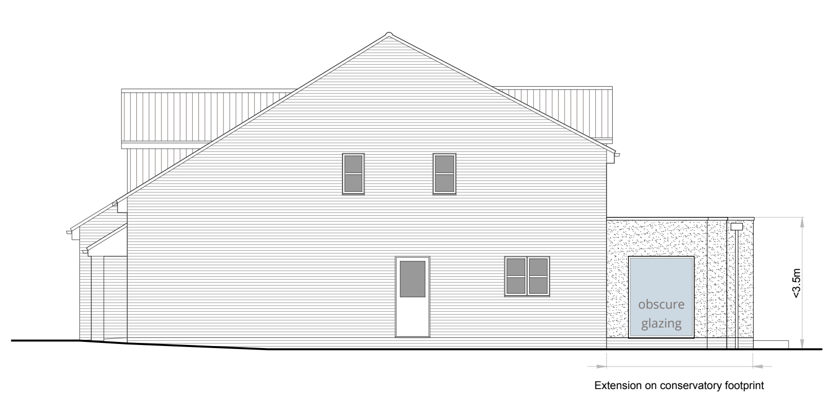
PROPOSED SIDE (SOUTH) ELEVATION 1:100@A1