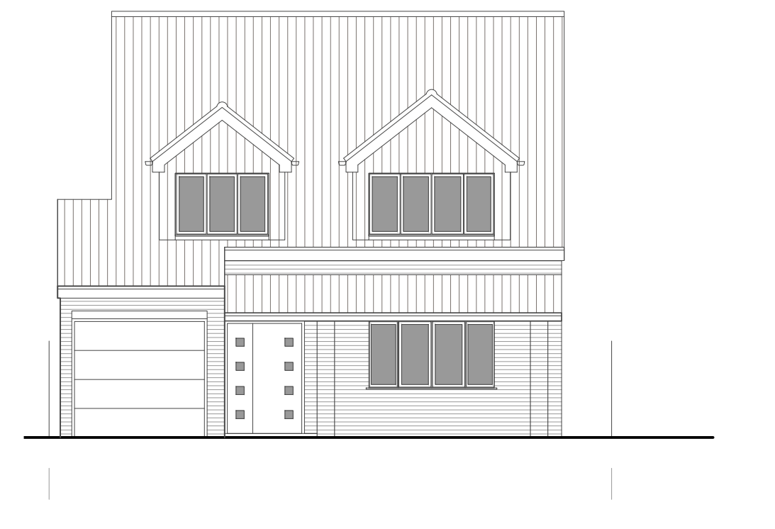
PROPOSED FRONT (WEST) ELEVATION - NO CHANGE 1:100@A1