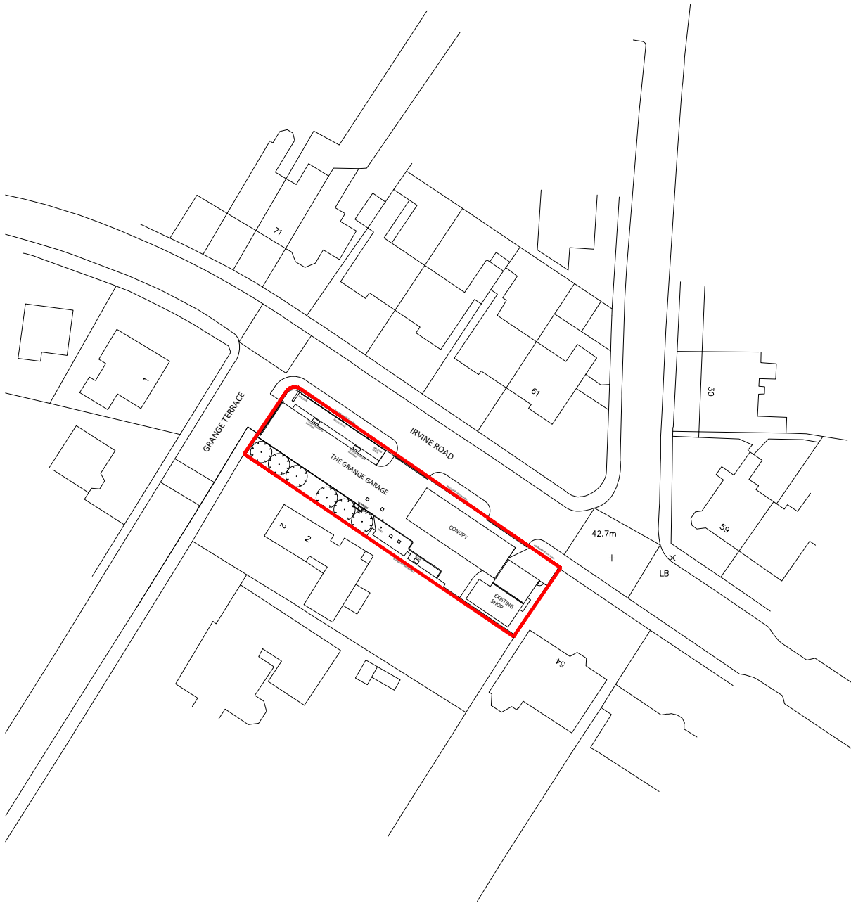
LOCATION PLAN 1:1000 @ A4