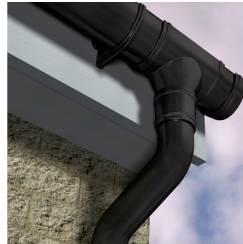
Rainwater Goods - RAL 9005 Jet Black

This document and its design content is copyright Gary Johns Architects ©. It shall be read in conjunction with all other project information including models, specifications, schedules and related consultants documents. Do not scale from documents. All dimensions to be checked on site. Immediately report any discrepancies, errors or omissions on this document to Architect.