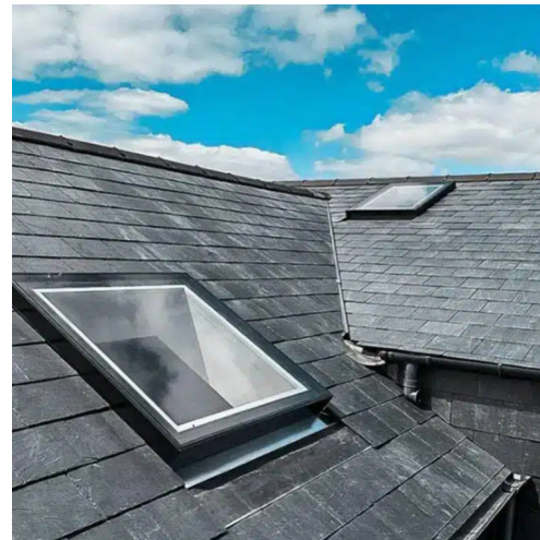
Rooflight - RAL 7016 Anthracite Grey