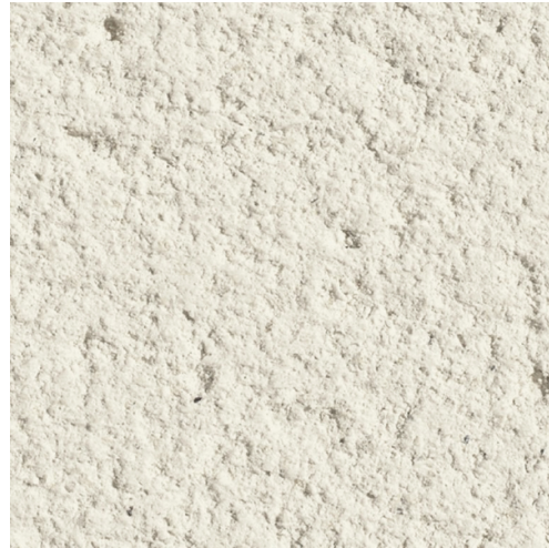
Render - by Weber Saint-Gobain in the colour 'white'.