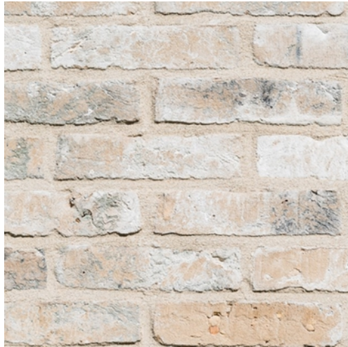
Brick - 'Majestic' by Vandersanden