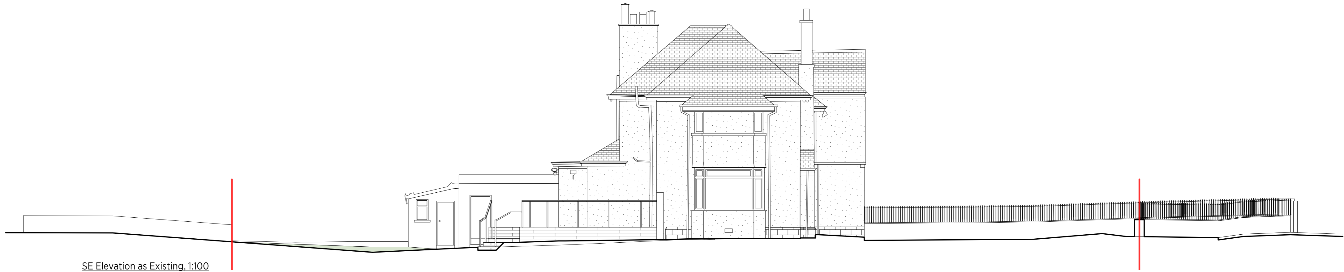
SE Elevation as Existing. 1:100