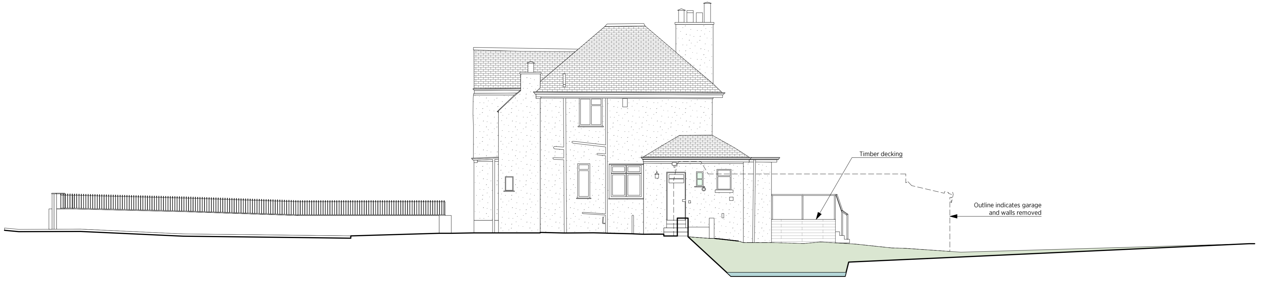
NW Elevation as Existing. 1:100

Rev: A Updated following planning comments. 01.02.24