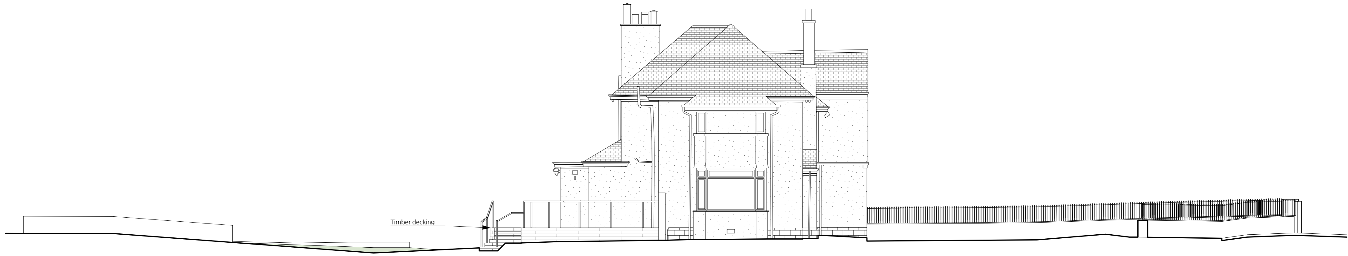
SE Elevation as Existing. 1:100

Rev: A Updated following planning comments. 01.02.24