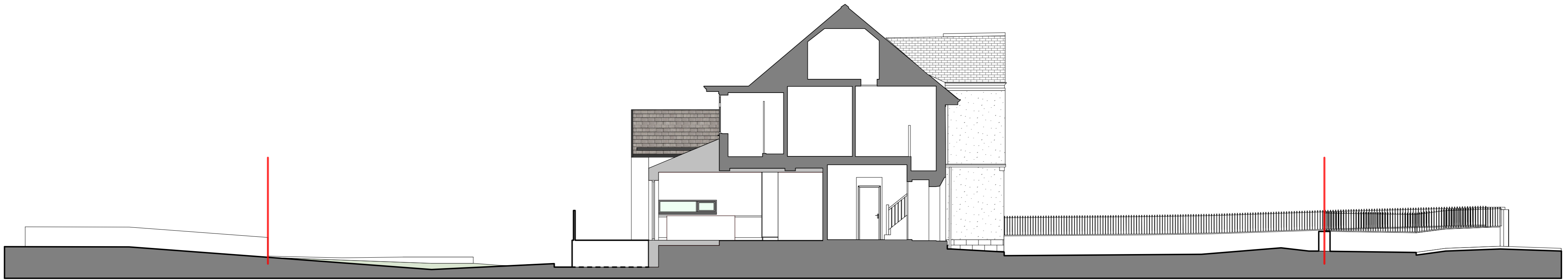
Section BB as Proposed. 1:100