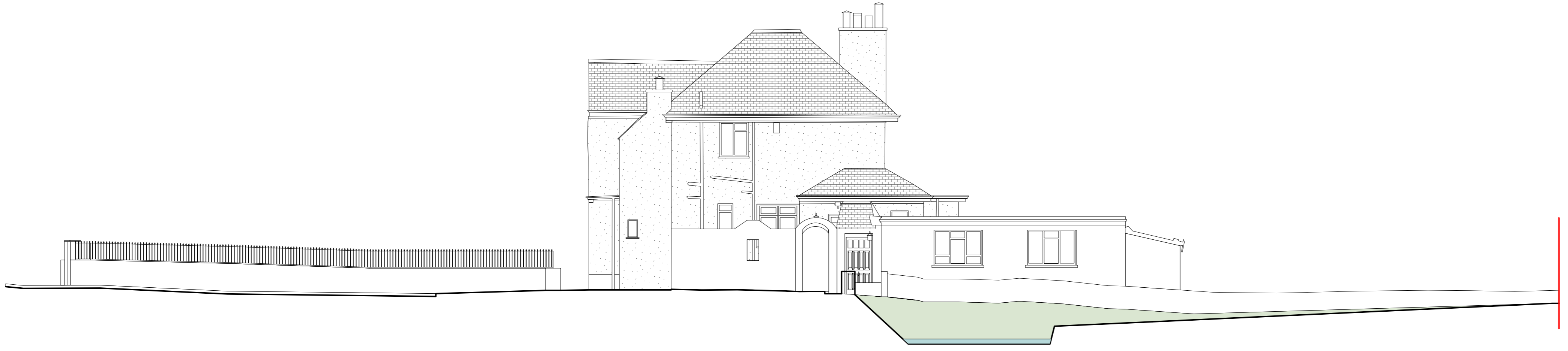
NW Elevation as Existing. 1:100