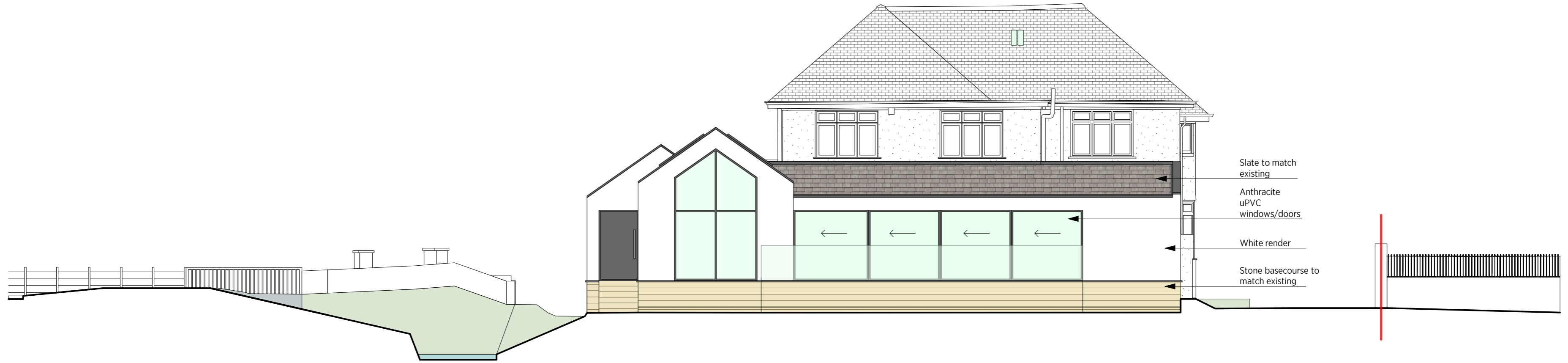
SW Elevation as Proposed, 1:100