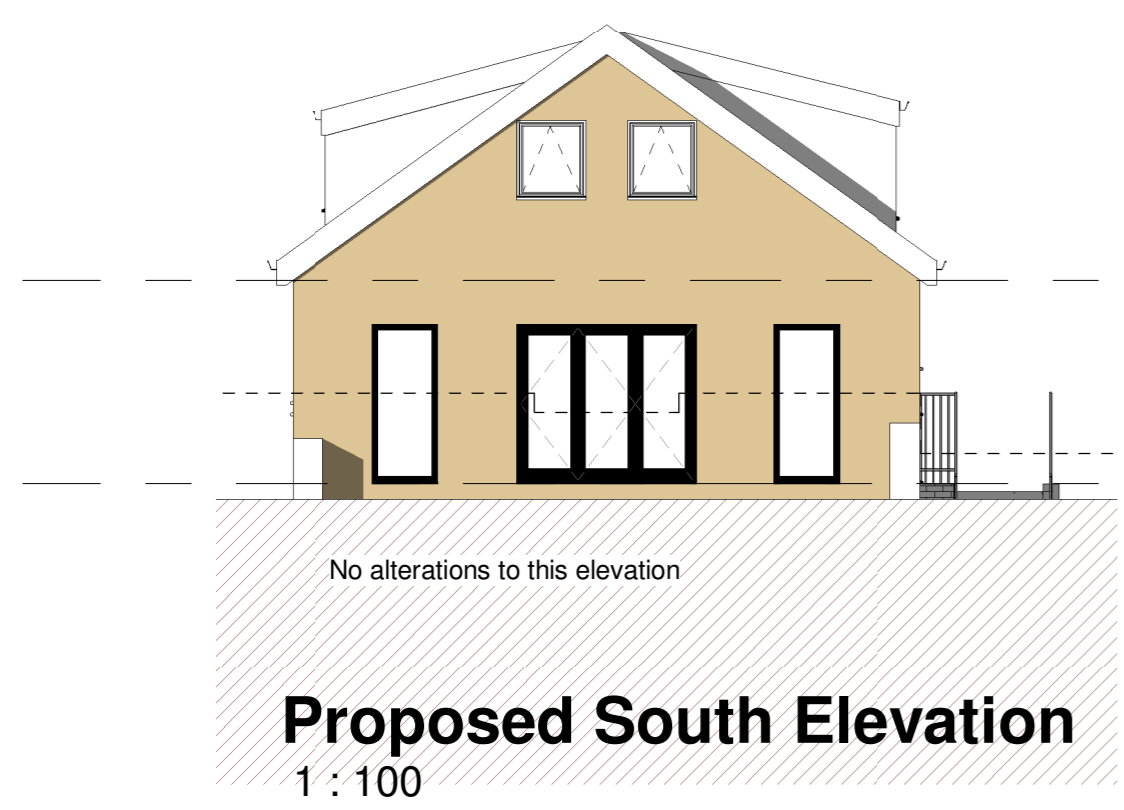
Proposed South Elevation 1 : 100

Materials Walls - A combination of red facing brick and stone to match existing. Doors - Black uPVC frame double glazed french doors. Windows - A combination of black uPVC frame and aluminium frame double glazed units to match existing.