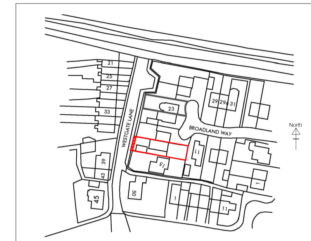
Site location plan @1:1250 scale