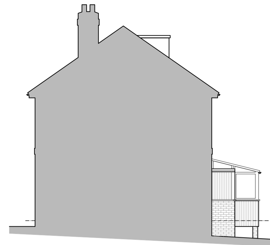
NORTH EAST ELEVATION/SECTION