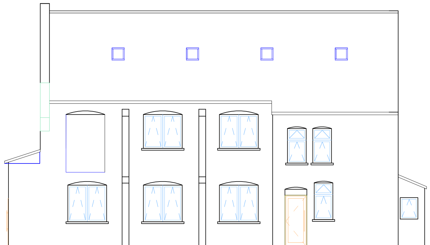
Staircase to be removed SOUTH EAST ELEVATION