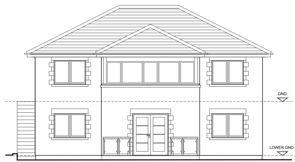
REAR (WEST) ELEVATION AS EXISTING

Do not scale the drawing. Use figured dimensions in all cases. Check all dimensions on site. Report any discrepancies in writing to Macdonald Dickson Architecture before proceeding.