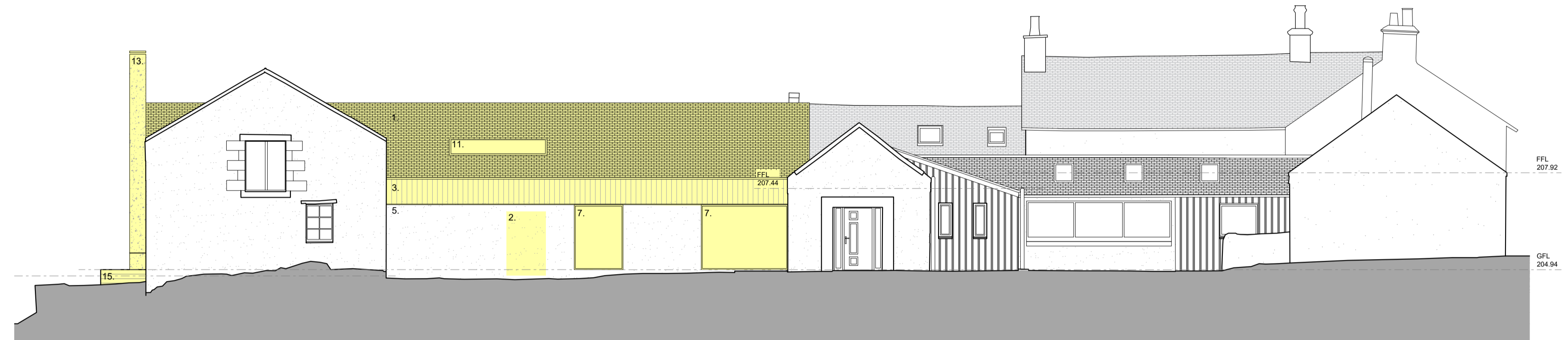
01 Proposed North Elevation 1:100