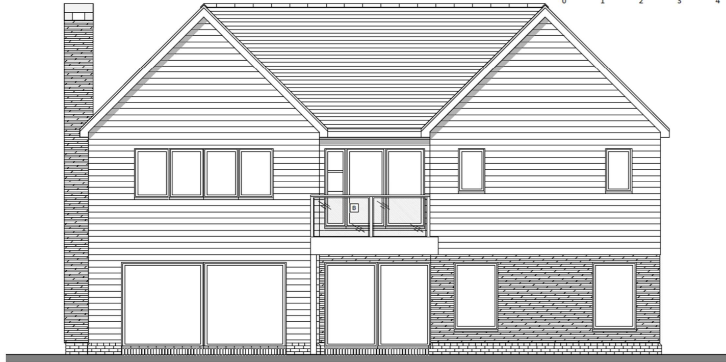
REAR ELEVATION (EAST)