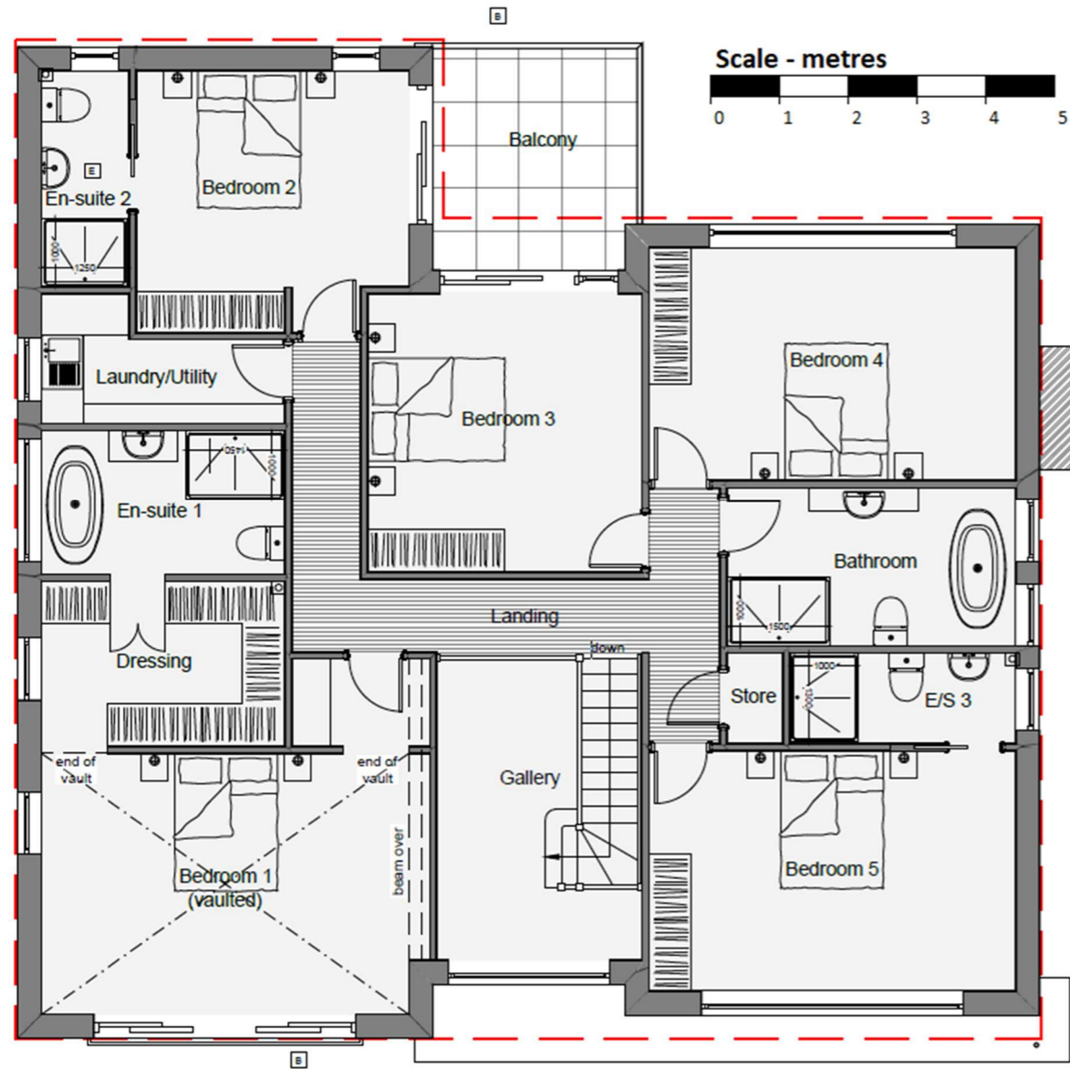
1st Floor plan - Existing